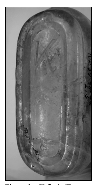
Figure 3 – K flask (Tucson Urban Renewal collection)

However, Barrett (1997:160) also noted that the Kemple Glass Co., Kenova, West Virginia, used the letter "K" as a logo on machinemade items after 1914. Burkholder & O'Connor (1997) noted that the firm was a tableware manufacturer from 1945 to 1970 – much later than Barrett's date. Regardless of the dating, however, an embossed "K" on tableware is unlikely to be mistaken for the "K" on bottle glass.