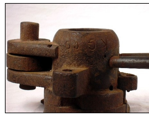
Figure 9 - KGCo mold 1

at Cedar Grove, West Virginia, made both packers and mineral water bottles ca. 1912, but that seems a bit late for both of these containers. However, we were able to trace the approximate business dates for four of the bottles listed by von Mechow (2017):