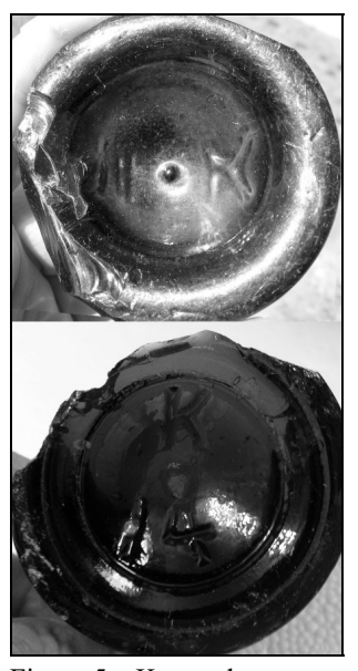
Figure 5 - K stout bases (David Whitten)

Wilson (1981:10) recorded a 2 ½" base embossed with XI K. He presented a photo of a Ft Union 'stout' bottle made from "dense green glass . . . . "with 'X I (raised dot) K' in the center of the base." We recorded a similar base fragment at Fort Bowie with "II" replacing the "XI" Roman numeral. Other examples from eBay – all on English stout or ale bottles – were embossed "II•K," "K•8," and "K•IX" plus "K / • / 14" sent to us by David Whitten (Figures 4 & 5).