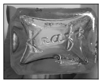
Figure 7 – Kraft base (eBay)