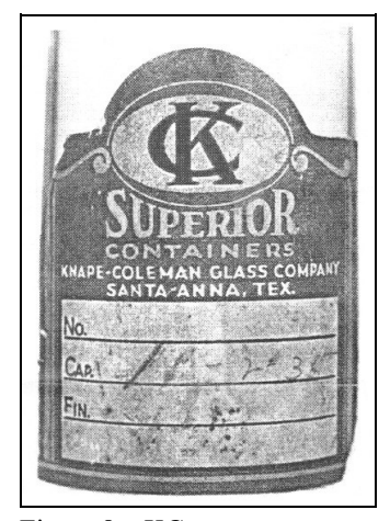
Figure 8 – KC monogram (Avants 2010:7)

Dairy Antiques (2016) noted that the Knape-Coleman Glass Co. used a "K superimposed over C" logo. Avants (2010:7) confirmed both the mark and the factory and noted that the location of the monogram was on the heels of its milk bottles, illustrating a blank or parison bearing a paper label that included a KC monogram (Figure 8). The only example we have seen was embossed on the heel of a milk bottle and was surrounded by a circle. Avants did not state whether any mark was used by the Texas Glass Co. (Knape-Coleman's predecessor), but we have not seen any marks that we would attribute to the firm.