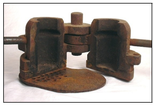
Figure 10 - KGCo mold 2

The Bill Lindsey collection contains a two-piece mold with "K.G.Co.218" engraved on the base. The base is the older type that created a single mold line across the center. The bottle appears to have been an ointment jar or bottle (Figures 9 & 10).