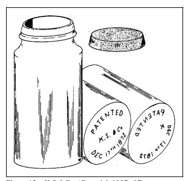
Figure 12 – K.S.&Co. (Creswick 1987a:97)

Creswick (1987:97) illustrated the K.S.&Co mark embossed horizontally across a fruit jar base. Also on the base was "PATENTED" (arch) / "DEC 17<sup>TH</sup> 1872" (inverted arch). A variation had the same patent information on the base as well as the letter "K" but in mirror image. The "K" is positioned in such a way as to suggest that it was the beginning of the "K.S.&Co" logo (Figure 12). Apparently, the engraver realized his error and stopped, but the company decided to use the baseplate anyway. The initials indicate King, Son & Co., Pittsburgh. Surprisingly, this jar was