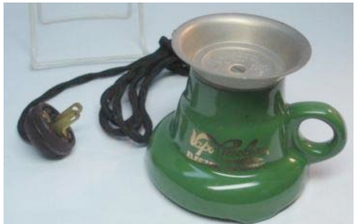
(Fig. 17. Vapo-Cresolene c.1950 electric vaporizer)