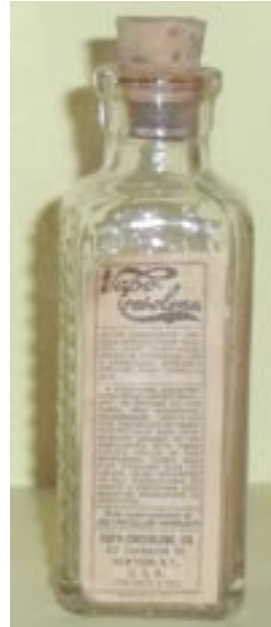
(Fig. 15. Vapo-Cresolene paper labeled bottle circa 1930)

Occasionally a Vapo-Cresolene lamp with a relatively tall clear glass chimney is found. It is just an example of an early apparatus where a substitute shade has been used for some unexplained reason (Fig. 16).