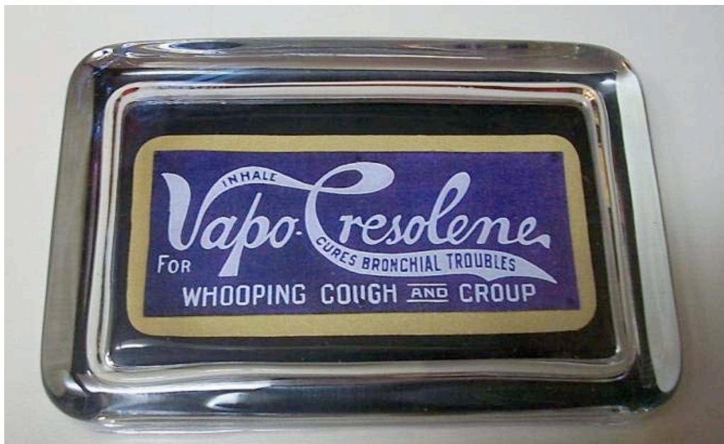
(Fig. 13. Vapo-Cresolene advertising paperweight featuring some of their favorite slogans)