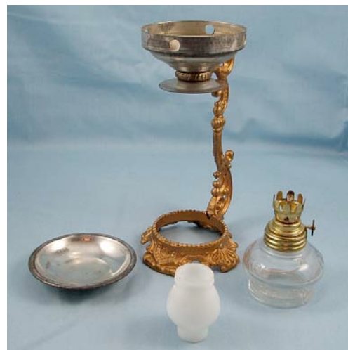
(Fig. 7. Four parts that make up Vapo-Cresolene vapoizor and lamp)