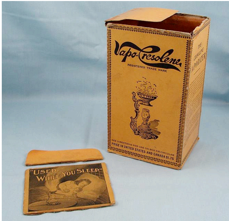
(Fig. 3. Vapo-Cresolene vaporizer box)