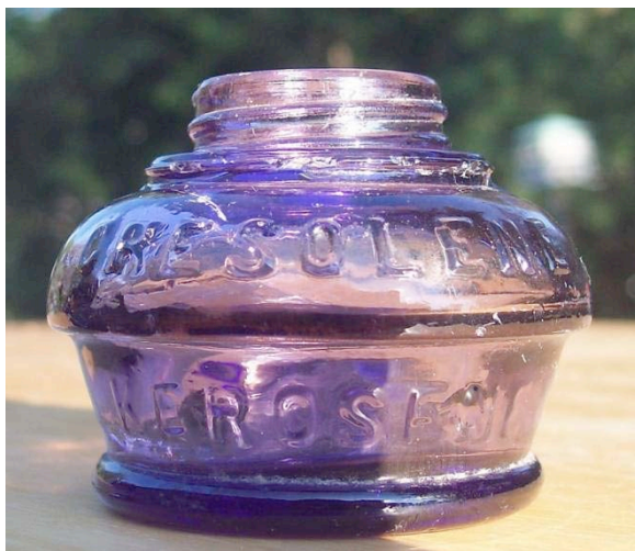
(Fig. 6. Sun colored lamp base in a rare purple color)