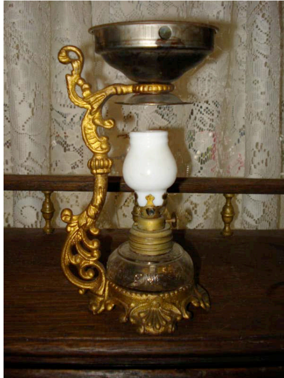
(Fig. 1. Vapo-Cresolene Vaporizer and lamp)