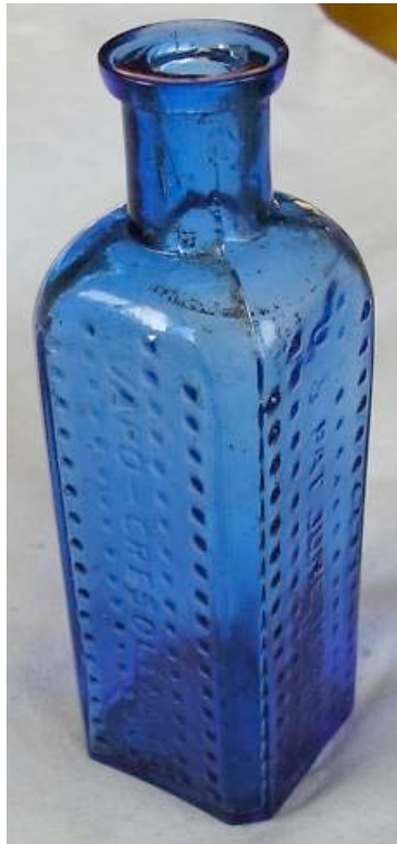
(Fig. 4. Rare blue Vapo-Cresolene bottle)