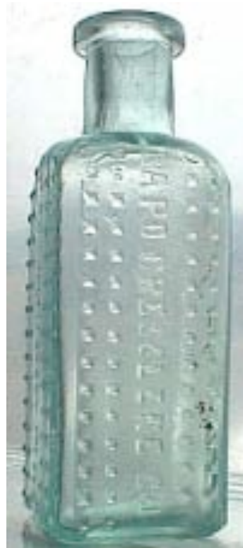
(Fig. 5. Typical Vapo-Cresolene (aqua bottle))