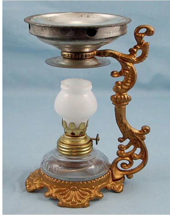
(Fig. 9. Vapo-Cresolene vaporizer)