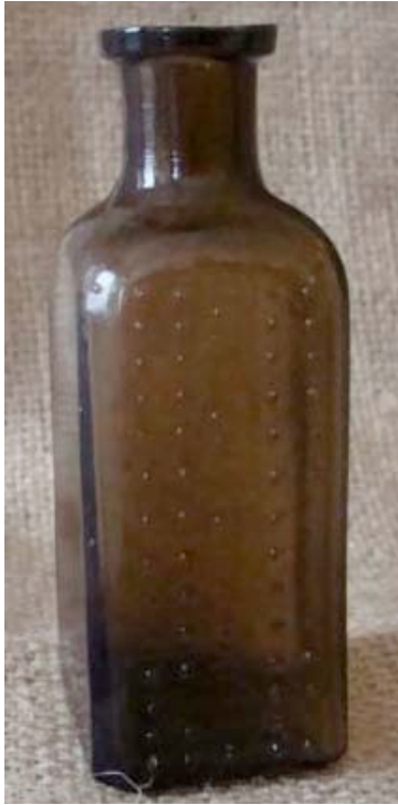
(Fig. 8. vapo-cresolene amber bottle)