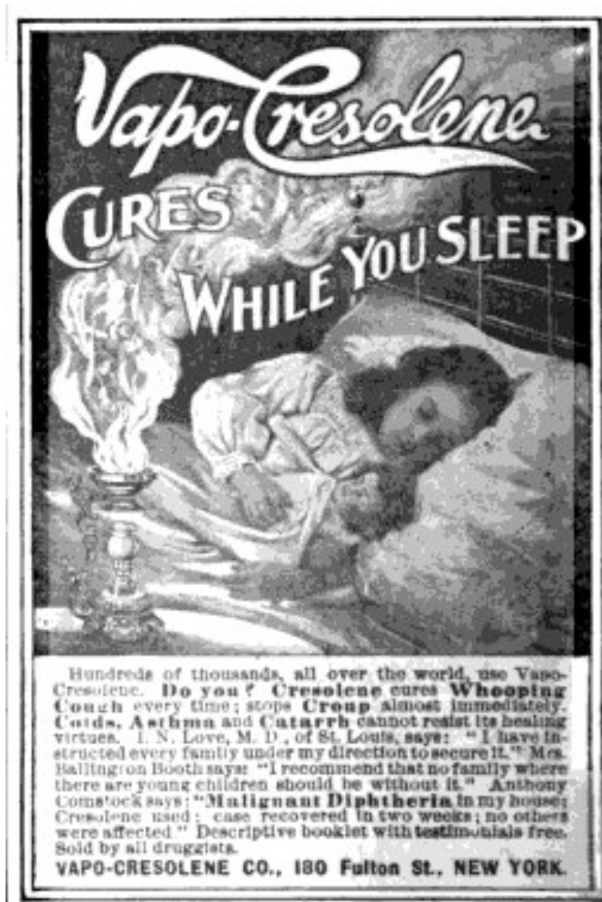
(Fig. 11. "Vapo-Cresolene Cures While You Sleep" adv.(1870)

A wide variety of advertising was used over the years to promote Vapo-Cresolene. Among those were several from the period around the turn of the century (Figs. 11, 12, 13). In their own way Cresolene bottles became familiar and were a form of advertising (Figs. 14, & 15).