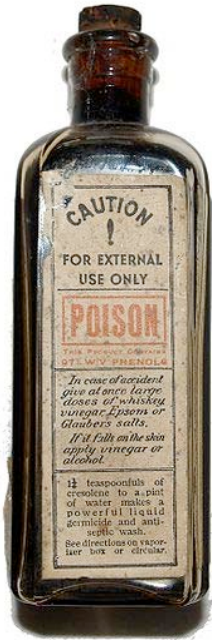
(Fig. 14. Vapo-Cresolene bottle circa 1930)