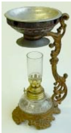
(Fig. 16. Vapo-Cresolene - vaporizer with clear-glass upright chimney (unusual))

Vapo-Cresolene and its vaporizers (Fig. 17) were on the market and sold until the mid-1950s or almost seventy-five years. The last examples were electric, made in green ceramic and very hard to find.