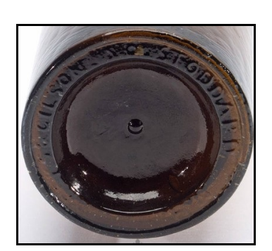
Figure 3 – Weeks & Gilson

Weeks and Glison (South Stoddard Glass Co.) made cylinder whiskey bottles embossed in Rickett's mold bases with "WEEKS AND