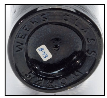
Figure 4 – Weeks Glass Works (Norman A. Heckler)

Some cylinder whiskey bottles were embossed "WEEKS GLASS WORKS" on the base in a circular format on a Rickett's mold (Figure 4). These were blown into dip molds or three-piece molds (Field 1975:58).