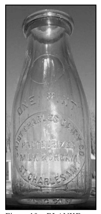
Figure 10 – BLANKE basemark with L.G.CO.52 heelmark

An eBay auction featured a bottle with the BLANKE basemark and a heelmark of "L.G.CO.52" (Figure 10). The L.G.CO.52 logo was probably the earliest mark used by Lamb, followed by the "L-52" logo. Unfortunately, we have not yet determined when Lamb changed from either of these early marks to the L52 mark (with the "52" nestled into the crook of the "L"), although the final change was probably after the "BLANKE" mark was terminated. The logo was likely used until the end of the company, sometime between 1923 and 1926.