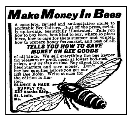
Figure 1 – Blanke & Hauck bee ad ( Des Moines Iowa Homestead 3/10/1910)

An El Paso Dairy Co. bottle was embossed with "BLANKE AND HAUK (arch) / SPECIAL (inverted arch) on the base and was also embossed in a round plate on the body