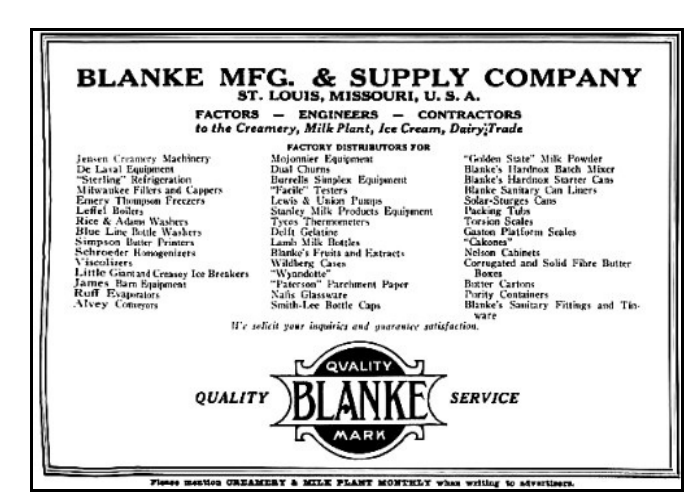
Figure 6 – Blanke Mfg. & Sup. Co. ad ( Creamery & Milk Plant Monthly 1922a:69)

A 1922 ad in Creamery and Milk Plant Monthly (1922:69) named the Blanke Mfg. & Supply Co., St. Louis, Missouri, as "Factors – Engineers – Contractors to the Creamery, Milk Plant, Ice Cream, Dairy