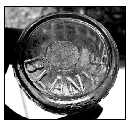
Figure 8 - BLANKE base

A bottle in our possession had 24 panels and was embossed with "SNOW & PALMER /