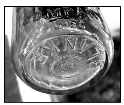
Figure 9 – L-52 heelmark and BLANKE base

COMPANY" on one side and "SEALED / HALF PINT" on the other. The front heel was embossed "L-52," with ""321" on the back heel and "BLANKE" (inverted arch) on the base (Figures 8 & 9). C.H. Snow, of the Snow & Palmer Branch, Beatrice Creamery Co., Bloomington,