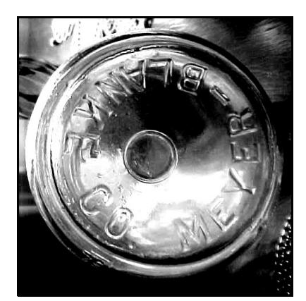
Figure 11 – MEYER-BLANKE basemark in counterclockwise format (eBay)

embossed "MEYER-BLANKE CO." in an inverted arch that wrapped (counterclockwise) almost entirely around the base. The bottle, unfortunately, has no manufacturer's mark. Similarly marked bottles have appeared on eBay, and one had the L52 mark (with the "52" nestled in the crook of the "L") embossed on the heel (Figure 11). The bottle styles were popular during the 1930s and 1940s, and the logo was used by the Lamb Glass Co. from ca. 1929 to ca. 1971 or later. We have arbitrarily chosen "1930s" as an ending date for the MEYER-BLANKE logo because other jobbers we have researched ceased using their own marks on milk bottles by that period.