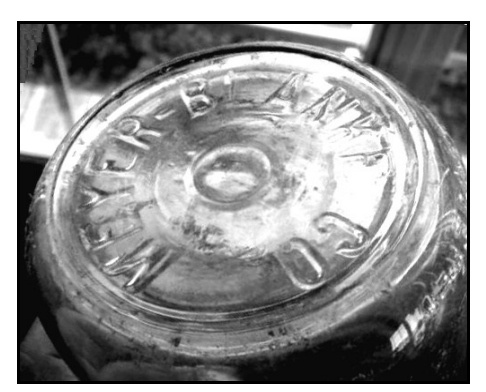
Figure 12 – MEYER-BLANKE basemark in clockwise format

The mark could have been used later or could have been discontinued earlier.