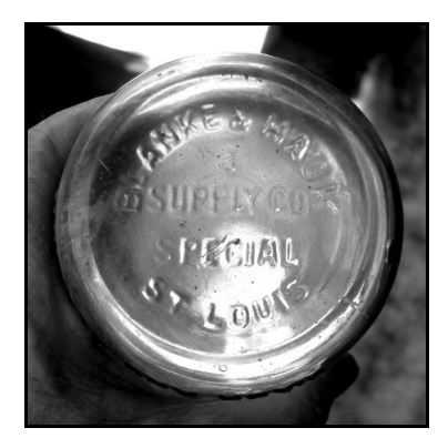
Figure 4 – Blanke & Hauk Supply Co. base

Bottles sold on eBay (and one in our possession) were embossed "BLANKE & HAUK (arch) / SUPPLY Co. / SPECIAL (both horizontal) / St. LOUIS (inverted arch)" on the bases (Figure 4). These spanned the transition from mouth blown to machine made based on eBay photos. This was almost certainly the second mark used by the company and was likely used until the firm dissolved in 1911.