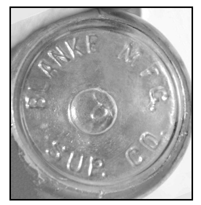
Figure 7 – BLANKE MFG. & SUP. CO. base

The Blanke Mfg. & Supply Co. embossed its name in the "BLANKE MFG. (arch) / & / SUP. CO. (inverted arch)" format on the bases of milk bottles it sold (Figure 7). This was probably the first mark used by the company, and it was listed by Giarde (1980:18).