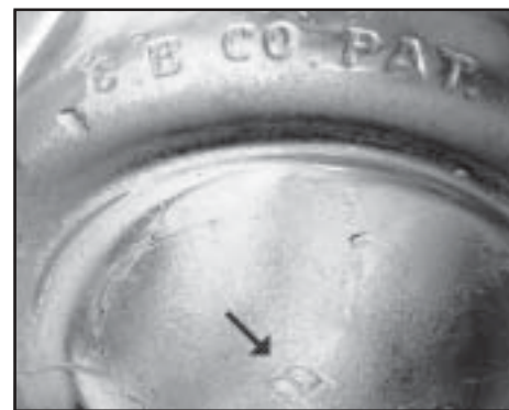
Figure 7: C.B.Co. Mark used by Boldt