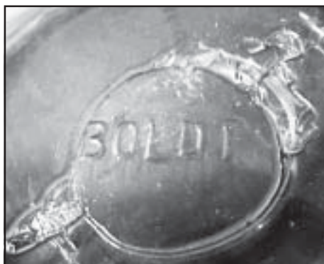
Figure 5: BOLDT Mark on Whiskey Jug