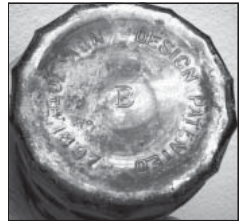
Figure 3: Serif B Mark on Catsup Bottle – No Owens Scar [TUR]

apparent catsup bottle, in the Tucson Urban Renewal collection at the Arizona State Museum. Along with the “B” mark, the base was embossed “DESIGN PATENTED / NOV. 30 TH , 1897” [Figure 3].