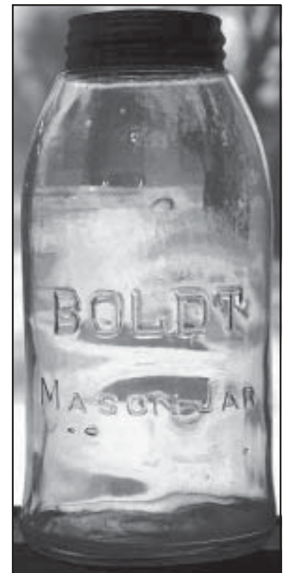
Figure 4: Boldt Mason Jar