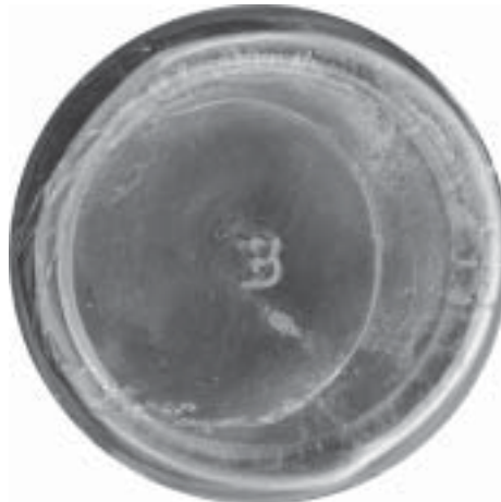
Figure 2: Serif B Mark with Owens Scar [Suzy McCoy]