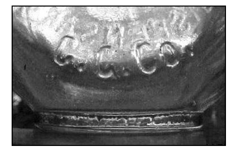
Figure 3 – C.G.Co. in an inverted arch – flask heel

In addition to the bottle/flask characteristics, the marks used by each company had certain features that help in matching a specific mark to a specific maker. According to Teal (2005:101), both sets of C.G.Co. initials were embossed on the reverse heels of Dispensary flasks in a slight inverted arch, while the round bottles had the mark in a horizontal format (Figures 3 & 4). However, the initials on