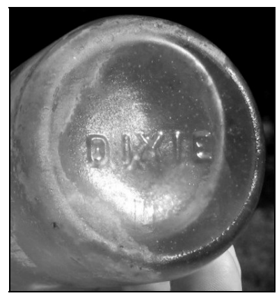
Figure 4 – Dixie on Coke base

embossed horizontally across to center of the base in block capital letters with no serifs. Both bottles were mouth blown with tooled finishes. The Hutchinson logo also has a "double-stamp" that is offset from the stronger logo. A straight-sided Coca-Cola bottle also had a "DIXIE" basemark with a double-stamp – a manufacturing technique primarily used on bottles during the 1895-1914 period (Figures 4 & 5). For more