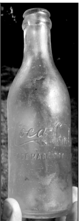
Figure 5 – Coca-Cola bottle

The 1922-1923 Obear-Nester catalog illustrated a Dixie Oval prescription bottle that it described as "a splendid bottle." However, the drawing did not show any markings on the base (such markings were illustrated on the only known Obear-Nester bottles to bear specific style names – Rex and AseptiC – so it is probably unrelated to those described above).