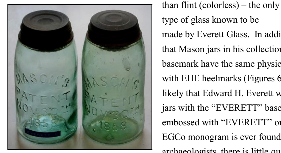
Figure 7 – EVERETT and EHE jars