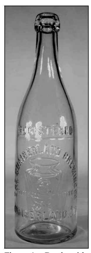
Figure 1 – Bottle with E.G.CO. base (von Mechow)

Von Mechow (2015) suggested that the Eastern Glass Co. of Cumberland, Maryland, produced bottles with this mark. He listed three beer bottles with basal embossing of E.G.CO. or E.G.Co., and two of those were for brewers in Cumberland – probably leading to his identification of the Eastern Glass Co. as the maker (Figure 1). See Discussion and Conclusions section for a more complete discourse.