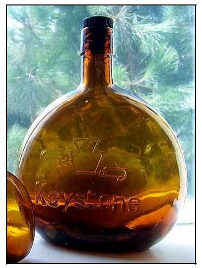
Figure 10 – Amber flask