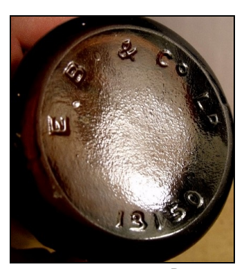
Figure 8 – EB&CoL<sup>D</sup> basemark (eBay)

Breffit used at least one mark after the firm became "limited." We have a single bottle embossed "EB&CoL<sup>D</sup>" (arch)" with an illegible five-digit number in an inverted arch below it, although others have been featured on eBay. The bottle is amber in color and was apparently a beer bottle. The finish was a one-part "blob" that was applied. Similar round bottles on eBay also had five digits, e.g., 13150 (Figures 8 & 9).