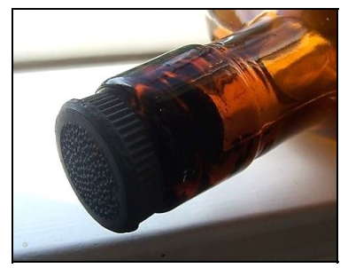
Figure 12 – Internal thread finish (eBay)