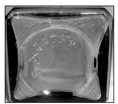
Figure 4 – B&CoLD basemark

Toulouse (1971:77, 79) claimed that the B&Co mark could have been used by Breffit & Co.; however, it was more likely a Bagley & Co. logo. We have found few examples of this mark – only one for "B&Co" (with two lines under the "o") (Figure 3). More common is "B&CO.LD." on bases