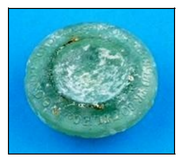
Figure 2 – Aire & Calder stopper (Museum Victoria 2013)

manufacture Canadian Lea & Perrins bottles – and, almost certainly, those used in Britain – until ca. 1920 (Berge 1968:189; Gerth 2006; Lunn 1981:8, 14; Rinker [1968]:27; Rock 2001:611). See the Other A section and/or Lea & Perrins for more discussion.