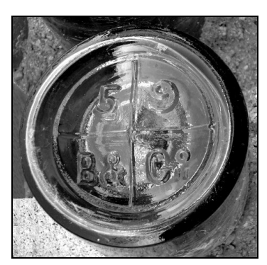
Figure 3 – B&Co basemark

Toulouse (1971:77, 79) claimed that the B&Co mark could have been used by Breffit & Co.; however, it was more likely a Bagley & Co. logo. We have found few examples of this mark – only one for "B&Co" (with two lines under the "o") (Figure 3). More common is "B&CO.LD." on bases