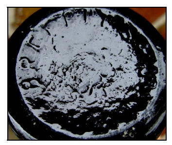
Figure 5 – Breffits & Co. basemark

According to Toulouse (1971:79), this mark was used by Breffits & Co. The company was in business under the Breffit name from ca. 1844 to 1921. We have seen "BREFFETS & Co" on the bases of English beer bottles with applied finishes on eBay auctions (Figure 5). Our only examples were very crudely made, probably prior to 1890. Tod von Mechow (2011) described four beer bottles used by Canadian brewers that were embossed "BREFFIT'S (arch) / MAKERS (horizontal) / LONDON (inverted arch)" on their bases.<sup>2</sup>