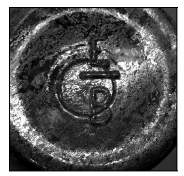
Figure 7 – Unusual EB mark (Fort Bliss collection)

returned to London in 1890 to set up an import house for the product. Sales were so good that James built a factory at Slough in 1908. In 1921, the company split into the American business and the rest of the world, served by the British factory. The British company acquired the American holdings in 1945 ( Wikipedia 2007). The base we recorded had a valve scar, suggesting a manufacture after ca. 1900. It is also possible that the E-over-B mark was some sort of factory code.