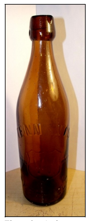
Figure 9 – Amber bottle (eBay)

Breffit used at least one mark after the firm became "limited." We have a single bottle embossed "EB&CoL<sup>D</sup>" (arch)" with an illegible five-digit number in an inverted arch below it, although others have been featured on eBay. The bottle is amber in color and was apparently a beer bottle. The finish was a one-part "blob" that was applied. Similar round bottles on eBay also had five digits, e.g., 13150 (Figures 8 & 9).