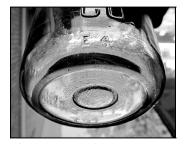
Figure 2 – E4 logo

We have not seen a single bottle marked with a subscript "4." This may well have been a Toulouse misunderstanding based on hand-written letters from collectors. It is, however, remotely possible that such a mark is one of the variations (Figure 2).