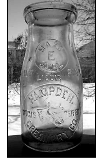
Figure 8 – MASS E SEAL – shoulder

more common variation, consisted of an arched "MASS" above an "E" with "SEAL" in an inverted arch completing the circle. The circular format was in use by at least 1914 and may have been used that early by Essex. Some were embossed on the body of the bottle (Figure 7), but the most common location was the shoulder (Figure 8). The latter format lasted until the sale to Thatcher in 1920.