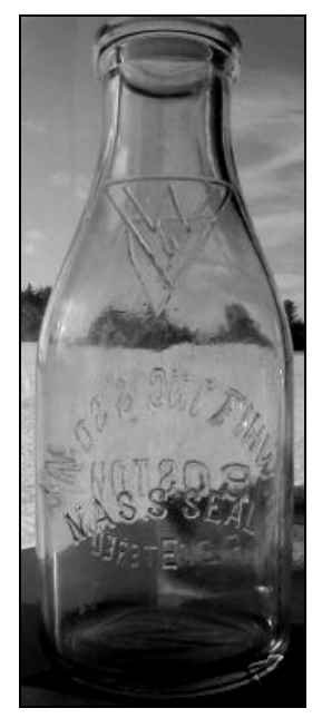
Figure 5 – MASS SEAL E (eBay)

SEAL (inverted arch). Each glass house had its own initial or initials for the central position (Blodget 2006:8; Schadlich [ca. 1990]).