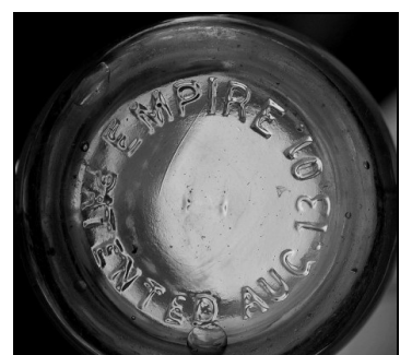
Figure 11 – EMPIRE base (Jay Hawkins)

In our study of 120 boxes of milk bottles at the California State Parks collection (Sacramento), we only found ten with the