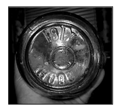
Figure 6 – Hood 1917 base

The Mass seal was reported in association with both the E4 mark and "E - 4 EMPIRE" marks on the front heels of Massachusetts milk bottles. The