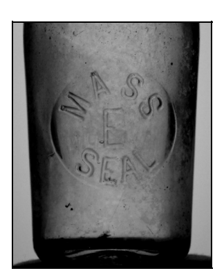
Figure 7 – MASS E SEAL – body

date codes embossed on the bases of its bottles (Figure 6). The second,