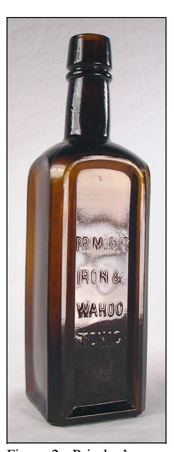
Figure 2 - Primley's

interesting characteristics. The letters "FG" in "MFG" and "O" in "CO" are smaller than the other letters. The tail on the "G" appears to have been added as an afterthought – as if the engraver used a "C" then