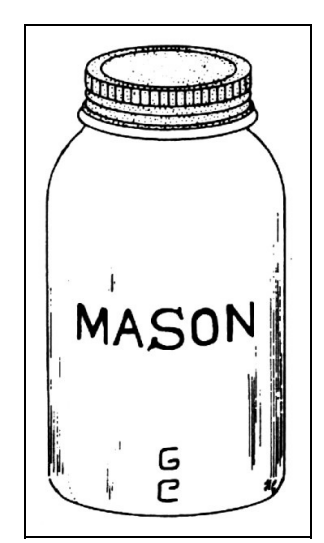
Figure 12 – Mirrored-G Mason (Creswick 1987a:115)

Roller (1983:216) described jar embossed "MASON (horizontal) / Naturally Fresh (arch with "TM" under the "al") / ® EASTERN (in a rectangle) / 6 {mirrored-G logo}" and dated it "1982 to date." He identified Glass Containers Corp. as the maker and noted that the jars were made for Eastern Foods of Atlanta, Georgia. He claimed that the jars were made from altered canning jar molds. Creswick (1987a:115) illustrated a Mason jar embossed "MASON" across the front with the mirrored-G logo on the front heel (Figure 12). She also attributed the mark to the Glass Containers Corp. and claimed it was made for Woolworth stores ca. 1975-1976. Roller (2011:320) also described this jar and noted that Glass Container was part of Hunt Foods by the time it was made.