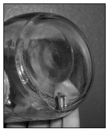
Figure 15 – Basal indentation

Roller (2011:219) described a variation with "a strange indentation at the left heel" that was probably "put there to assist in orienting the paper label during attachment." A photo from an eBay auction shows the indent clearly (Figure 15 – also see Figure 13). The auction also showed the lid (Figure 16). Similar (although not identical) indentations of various sorts were used in the early days of Applied Color Lettering (ACL) for aligning the color label process.