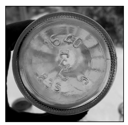
Figure 8 – GC catsup base

To complicate the issue, Patty McFarland sent us photographs of jars from a California State Parks collection marked with the GC monogram and codes of 2, 3, and 7 to the right of the monogram on the same line. Below those was 3512, almost certainly a model code. If the single digits were date codes, they could only be 1942 and 1943 (the plant was not completed until 1934), although the "7" could be 1937 (McFarland 2011). Some of these jars had bases with blowand-blow machine scars, and others had valve scars. This indicates a manufacture by two different types of machines – possibly Miller and Lynch.