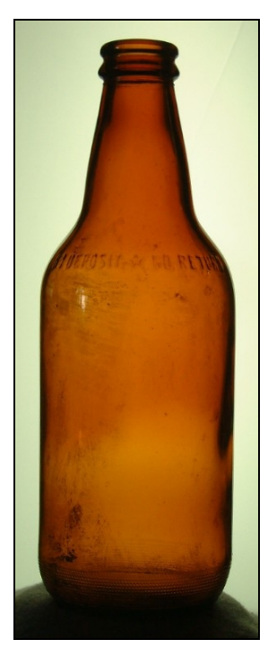
Figure 7 – Select beer bottle

S (plant code) GC (logo) 5 (date code) 4799 (model number) 2 (mold code)