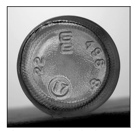
Figure 11 – Mirrored-G base