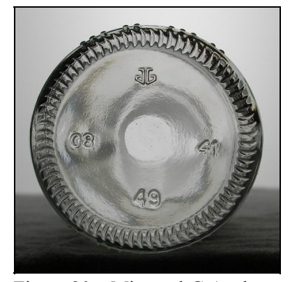
Figure 20 – Mirrored-G Anchor logo

As noted in the section on Anchor-Hocking, the mirrored-G-anchor logo was adopted along with the change in the company name in 1987 – probably to reflect bringing the former Glass Containers Corp. under the AnchorGlass umbrella. The