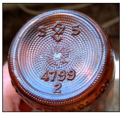
Figure 6 – Beer base

these were embossed "Coors" on the shoulder and were made by Glass Containers, Inc. All were marked with the GC logo and various codes, including single-digit numerals to the right of the logo. These include "5," "6," and "8" – almost certainly date codes for 1955, 1956, and 1958 (Figures 6 & 7).