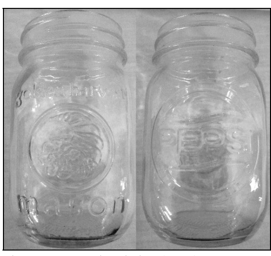
Figure 14 – Pepsi variation (eBay)

The Roller update (2011:319) discussed another jar embossed with the logo. This one was a rounded-square jar embossed "MASON" below the shoulder with a number and the mirrored-G logo at the heel. The jars were marketed by Glass Containers Corp. under the name "Golden"