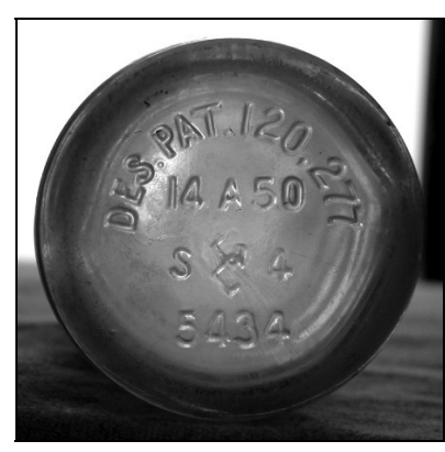
Figure 5 – Pepsi-Cola base

Our sample of soda bottles is small, but date codes extend from 1946 to 1965. Many are on Pepsi-Cola bottles. Pepsi required the makers of its containers to follow Pepsi company guidelines. One example was embossed "DES. PAT. 120,277 (arch) / 14 A 50 / S {GC logo) 4 / 5434 (all horizontal)" (Figure 5). The design patent was for the Pepsi "wave" bottle, and the requirements were identical for all manufacturers. Both the "14" and the "A" are mysteries. Our few hypotheses (e.g., "14" could equal the manufacturer, or "A" could be a plant code) have disintegrated under testing; the