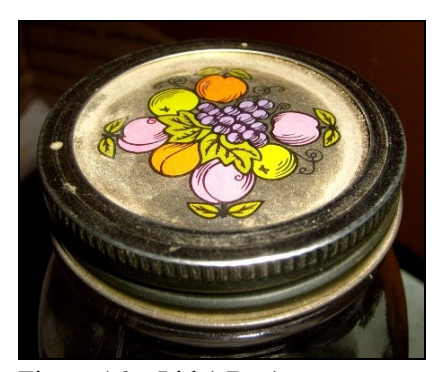
Figure 16 – Lid