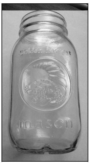
Figure 13 – Harvest Mason

The Roller update (2011:319) discussed another jar embossed with the logo. This one was a rounded-square jar embossed "MASON" below the shoulder with a number and the mirrored-G logo at the heel. The jars were marketed by Glass Containers Corp. under the name "Golden"