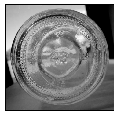
Figure 18 – Harvest base

been made during this period. Diamond-Bathurst also made the jars during the 1985-1987 period, and these probably had no logo (see below for a discussion of these later firms). The final jars were made by the Anchor Glass Container Corp. from 1987 to at least 2011, when my wife bought one (Figure 17). These were