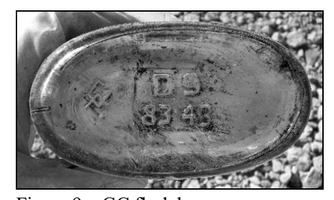
Figure 9 – GC flask base

At least one liquor flask, found by Jessica Hale, was embossed with a 1943 date code and an 83 factory code. The base was embossed "GC" (angular/connected) to the left and "D9 / 83 43" to the right (Figure 9). "D9" indicated the distiller; "83" was the manufacturer code; and "43" identified the date (1943).