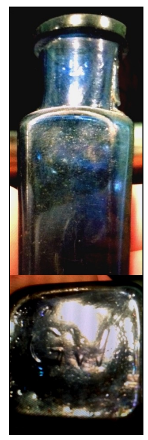
Figure 3 – Cobalt blue (Brandon Smith)

In addition, we found several complete colorless medicine bottles and flasks in the Fort Riley hospital collection (Lockhart et al. 2012). The marks on these are worth some discussion. We included a study of the "G" in "BGCo" in the Belleville Glass Co. section, and part of that is worth repeating here. The important finding was that one of the "G" formats was datable. The capital "G" as embossed on glass bottle bases typically was engraved in several styles, all based on the serif: 1) serif extending right; 2) serif extending left; 3) serif extending to both sides; 4)