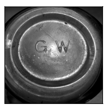
Figure 2 – GW base (NPSWACC)

Herskovitz (1978:8) found a single beer bottle base embossed with a "GW" mark. The base had no accompanying letters or numbers and was found at the second Fort Bowie, occupied from 1868 to 1894. He did not attempt to assign a date or company to the mark. When the Bottle Research Group examined the Fort Bowie collection at the National Park Service Western Archaeological and Conservation Center (NPSWACC) in 2007, we discovered a colorless base with a "GW" mark that was approximately beer-bottle-base size (Figure 2). This was probably the base misidentified by Herskowitz. As far as we can tell, no glass firm with "GW" initials made beer bottles.