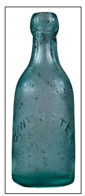
Figure 11 – Gottlieb Wurster bottle (Urban Remains)