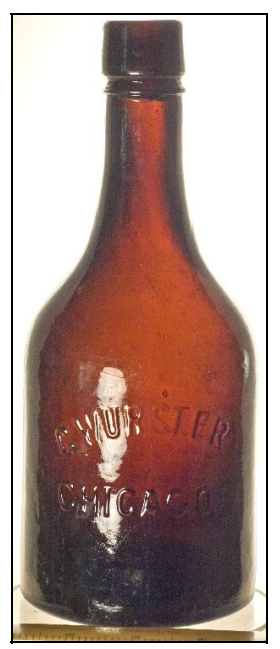
Figure 8 – Gottlieb Wurster base (Farnsworth & Walthall 2011:458)

Undeterred, the corporation moved the equipment to Paola, Kansas, reorganized as the Paola Glass Co., and built a new plant in 1887. When the local gas company reneged on its agreement and failed to supply sufficient gas, the factory closed