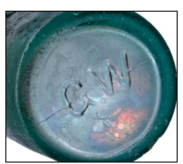
Figure 10 – Gottlieb Wurster base (Urban Remains)

survived similar problems. Also, in 1886, the firm offered to relocate to nearby Alton, Illinois, but Alton apparently refused to meet the firm's