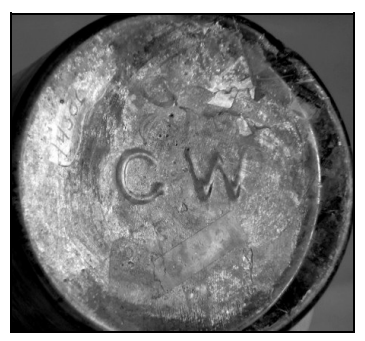
Figure 6 – Right-serif G (Fort Stanton)

A second important characteristic of the "GW" logo was the shape of the "G." A typical "G" found embossed on glass – regardless of the serif format – was narrow or oval in configuration. The "G" in "GW" – however – was rounded or circular in shape. The letter is thus quite diagnostic.