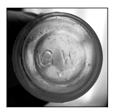
Figure 4 – Serif & post G (Tucson Urban Renewal collection)

an upright post with no serif; and 5) serif or "tail" in the shape of a hook or reversed comma, extending downward. The first of these – serif extending to the right – was fairly common during the ca. 1876-1880 period but was infrequently used later – and very rare after ca. 1878.