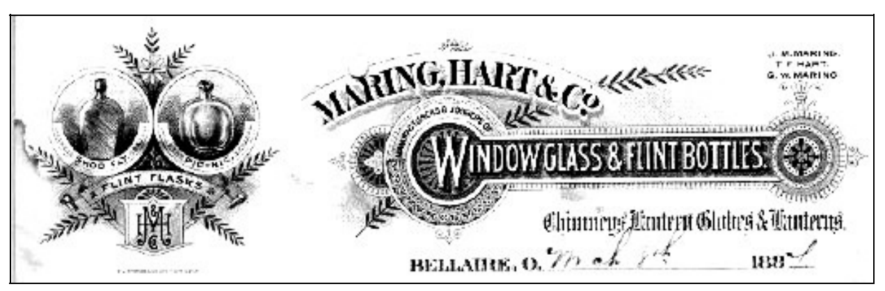
Figure 1 – 1887 letter (West Virginia Museum of Glass)

1886 letterhead as "mfrs. & jobbers of Window Glass and Flint Bottles, Chimneys, Lantern Globes and Lanterns." The letterhead illustrated shoo fly and picnic flasks as well as an MH&Co monogram – although the monogram has never been reported on glass containers (Roller 1998a). A similar letterhead from the West Virginia Museum of Glass requested a mold from Charles Yockel. Although the letter described the mold in detail, it did not ask for a manufacturer's mark (Figure 1). The firm moved its headquarters to Dunkirk and built a factory at Muncie (both in Indiana) in 1888.