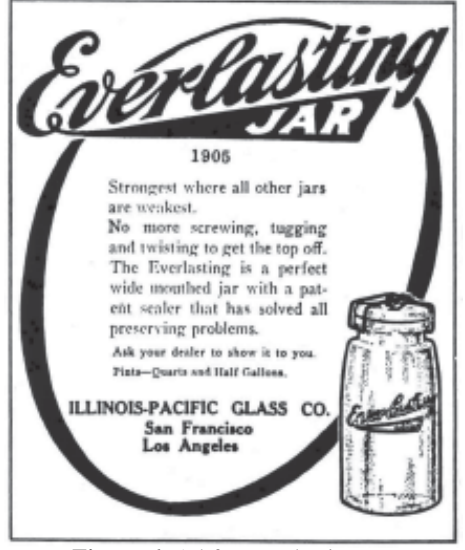
Figure 6: Ad for Everlasting Jar [Creswick 1987:195]

This brings up the timing of the use of the Owens Automatic Bottle Machine by Illinois Pacific. The Illinois Glass Co. obtained an Owens license in 1911 (probably for the manufacture of pharmaceutical bottles). Actual production likely began a year later. It is possible that Illinois Pacific, a subsidiary of the Illinois Glass Co., was able to make use of the