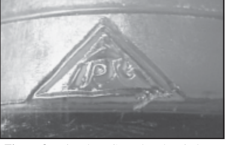
Figure 8: Triangle IPG Heelmark [Lindsey]