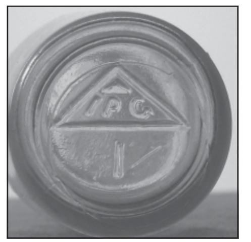
Figure 9: Triangle IPG Basemark [Lockhart]

Triangle IPG mark could be dated from 1925 to 1931. We attribute the mark to the Corporation period.