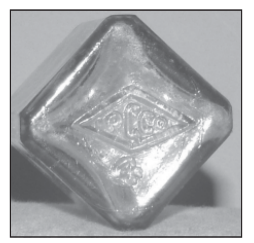
Figure 3: IPGCO in a Diamond [Lockhart]

The mark was also used on jars. Colorless Boyd Mason jars with continuous-thread finishes were embossed I. P. G. Co. in a diamond on the base during the 1910-1920s period. A variation had the I. P. G. Co. on the heel. A version of the IMPROVED Everlasting JAR also was embossed with IPGCo in a diamond on the base as was the SEALTITE WIDE MOUTH MASON (Creswick 1987:121; Roller