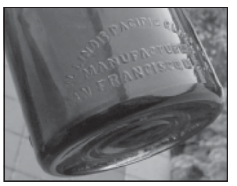
Figure 7: Illinois Pacific Bottles Exported to New Zealand [Crouch]

Creswick (1987:52) also described a second version of the IMPROVED EVERLASTING JAR that was marked on the base with "I. P. G. Co. S. F. Cal. (within а triangle)" (her parentheses). Unfortunately, she did not illustrate the base of this jar. If she is correct, it would be the only recorded instance of the letters I P G Co in a triangle. I suspect it is more likely that she meant the initials were in a diamond with the city/state designation around the edges. Roller (1983:164) described the jar as "IPGCO S F CAL in diamond logo embossed on base" (note there are no periods in the Roller version).