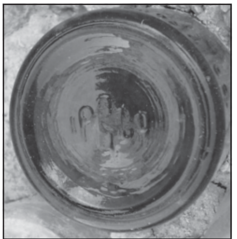
Figure 2: IPGCO Basemark [Lindsey]

We found one interesting bottle that was embossed with I. P. G. Co. on the heel and IPGCO-in-a-diamond on the base (ca.