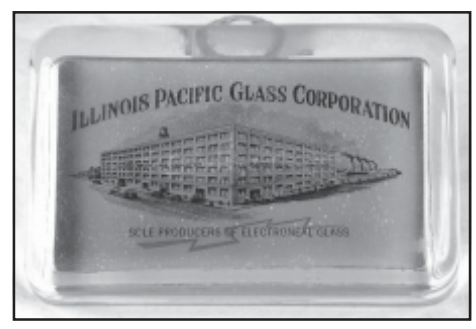
Figure 10: Electoneal Paperweight [Lindsey]

On bottles that should be from 1926, there are no identifiable date codes. However, the number "7" appeared in one of the formats described above (usually the number to the left) on all bottles that can