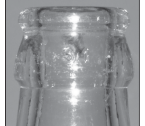
Figure 13: Date Code on Crown [Lockhart]

and Pacific Coast, and before merger with