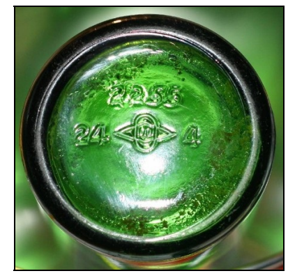
Figure 7 – Owens-Illinois Pacific soda base

This was apparently a common occurrence. Creswick (1987:106) noted a PRESTO GLASS TOP jar marked MANUFACTURED BY ILLINOIS PACIFIC GLASS CORP. that also had the Diamond OI mark on its base. Apparently, the Owens-Illinois Pacific Coast Co. used a mold from the Illinois-Pacific Glass Corp. with a newer Owens-Illinois baseplate. Unfortunately, Creswick did not fully illustrate the jar; it would have been instructive to have seen the factory and date codes on the base.