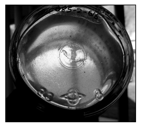
Figure 6 – Owens-Illinois Pacific milk base (California State Parks collection)

Our study of milk bottles in the California State Parks collection at Sacramento (Schulz et al. 2009) produced interesting results. We observed milk bottles embossed with date-coded Owens-Illinois logos (actually from the Owens-Illinois Pacific Coast Glass Co.) from the four California plants (Figure 6). The date codes we found indicate the following dates when milk bottles were produced. It is important to note that the factories may have been open and producing other bottle types during other years.