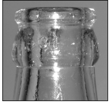
Figure 3 – Crown date code

codes of "31" and "32" on the reinforcing rings of the crown finishes verify the mark as belonging to the Coast Co. (Figure 3). The codes are found on reinforcing rings on soda and Citrate of Magnesia bottles (and possibly on other bottle types that used crown finishes, such as catsups). Although date codes for the Coast Co. may appear on either the crown, the heel, or both, the crown code is usually the defining feature. The marks were only used in 1931 and 1932.