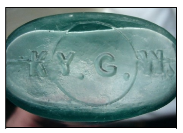
Figure 3 - KY G W

Toulouse (1971:179) observed the mark (possibly in the separated form with a "5" below the logo) on a grooved-ring wax-sealer fruit jar and dated the mark ca. 1855, obviously mistaking it as