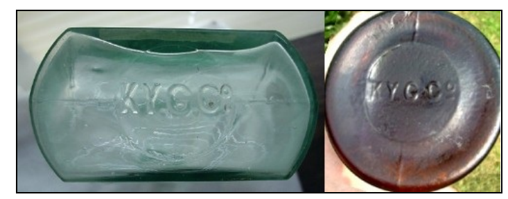
Figure 11 − KYGC<sup>o</sup>