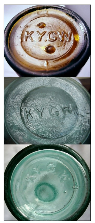
Figure 2 – KYGW variations

According to Whitten (2005:43), this is the most common mark used by the Kentucky Glass Works Co. It has been found on wax-sealer fruit jars, medicine and bluing flasks, coffin flasks, blob-top beer bottles, square cathedral pickle bottles, and generic pepper sauce bottles (as well as other types). Toulouse (1971:313) dated the mark from "1849