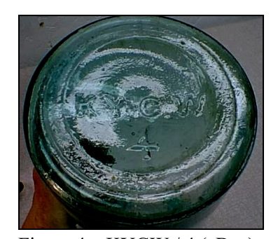
Figure 4 – KYGW / 4 (eBay)

In some cases, the punctuation is very faint.