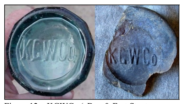
Figure 12 – KGWCo (eBay & Fort Stanton

have been used by the Kentucky Glass Works; however, he offered no dates. We have also found the mark on an amber export beer bottle base and a mug-base Hutchinson soda bottle. Hutchbook (Fowler 2016) listed the logo on seven Hutchinson bottles. Our sample of photos shows both "K.G.W.Co." and "KG.W.Co." variations – note position of periods (Figure 12).