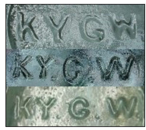
Figure 14 – K fonts

of "K" fonts (Figures 13 & 14). None had serifs. Note in Figure 13 the differences in the fonts.