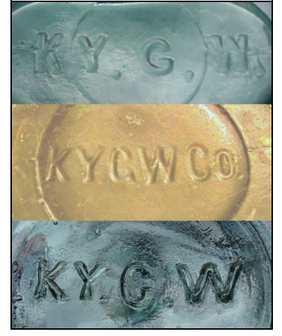
Figure 15 – G fonts

The letter "G" was also embossed in at least