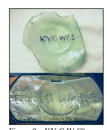
Figure 9 – KY.G.W.Cº