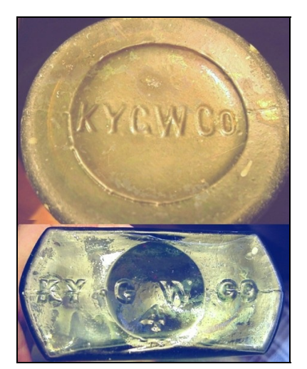
Figure 7 – KGWCo variations

Toulouse (1969:179) noted the earlier Kentucky Glass Works (ca. 1855) as the maker of a grooved-ring wax-sealer fruit jar, marked "KY.G.W.Co." on the base. In his later book, Toulouse (1971:313) also attributed this mark to the earlier company and dated it "1849 to 1855 or later." Roller (1983:186; 2011:286) suggested that the Kentucky Glass Works was the manufacturer but failed to offer a date. Creswick (1987a:97) illustrated the mark on a wax sealer and identified the Kentucky Glass Works as the maker but also offered no dates (Figure 5).