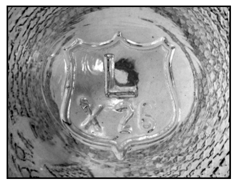
Figure 1 – L / X 26 Shield (eBay)

One, for example, was embossed "ARROWHEAD (arch) / {embossed arrowhead} / LOS ANGELES (inverted arch) on the body (to be read with the finish pointing down – as in a