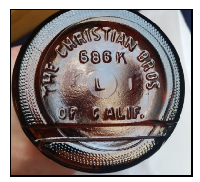
Figure 24 – L basemark

Toulouse (1971:316) showed a sans serif "L" as being used by Latchford "since 1957." The mark was not listed in Peterson (1968) or Giarde (1980), but we have seen a "L" embossed in the center of amber wine bottles made for Christian Bros. of California. Our examples had a stippled resting point, and the "L" was slightly off center in a faint circle. From about 1930 or so, the most common way of altering embossing was to drill out the old lettering or numbers, fill the hole with a dowel, grind the dowel flush with the bottle base, and stamp in a new