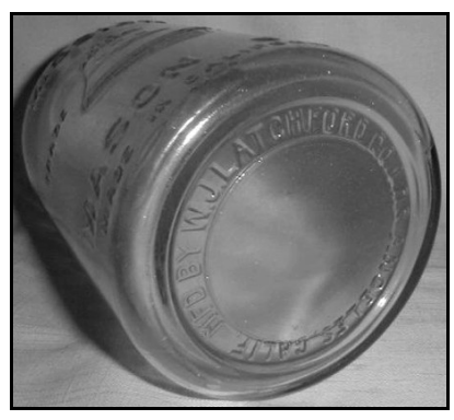
Figure 11 – Mission base

At least one mold was made with California misspelled as "CALIFORINA" (Figure 13). Roller (1983:253) dated the jars 1926-1930s and added that: