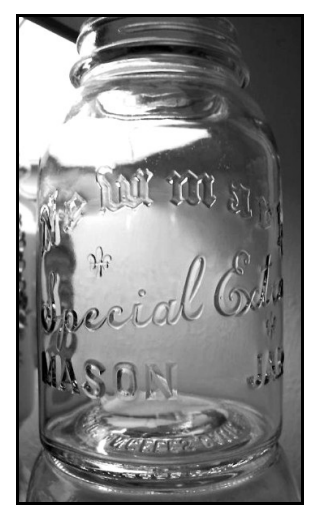
Figure 14 – Newmark jar

An eBay auction offered a jar embossed "Newmark" (arched fancy German font) / Special Extra (slight upward cursive) / MASON NAR (horizontal)" with small Fleur-de-lis between lines on the front and "MADE FOR M.A. NEWMARK & CO. LOS ANGELES, CALIF." in a circle around an Oval-L logo on the base (Figures 14 & 15). Roller