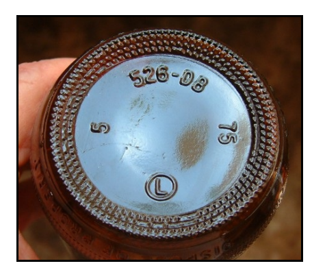
Figure 25 – Circle-L beer

The Circle-L mark was used by the Latchford Glass Co., Los Angeles, California, beginning in 1957. It was also shown in 1982 and was still listed in 1996. However, no listing for Latchford remained in 2005 (Emhart 1982:75; 1996:48; 2005; Powell 1990). Beer bottle date codes extend at least to 1975: "5 526-DB 75 (arch) / Circle-L" (Figure 25), although smaller bottle was only embossed "{five dots in a wavy line} / Circle-L / 3" (Figure 26). We have only