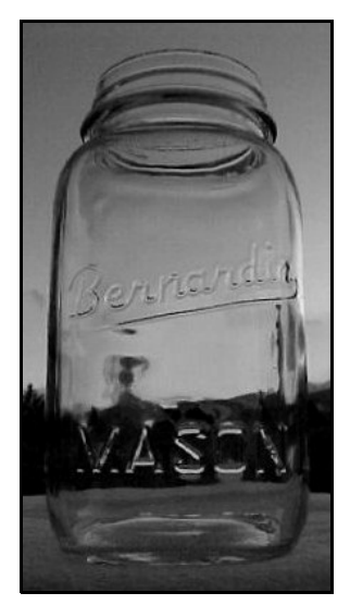
Figure 20 – Bernardin jar

Toulouse (1969:46) listed a jar embossed "Bernardin (upwardly slanted cursive with underlining tail) / MASON" on the body and "W.J. LATCHFORD CO., LOS ANGELES" in a circle on the base (Figure 20). He dated the jar "between 1932 and 1938." He noted that a variation was embossed "EXCELLENT FOR JELLIES" on the reverse. He also listed a variation