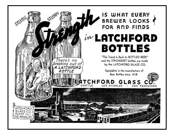
Figure 4 – Latchford ad ( Western Brewing World 1937:29)

A study of rim code dating on California milk bottles (Schulz et al. 2009) suggests that the Circle-L mark was also used by the earlier Latchford company. The mark was associated with September and October 1932 date codes on milk bottles. During this first business, Latchford may have only used the Circle-L logo on milk bottles. A 1937 Latchford ad for Stubby and Steinie non-returnable beer bottles illustrated what may have