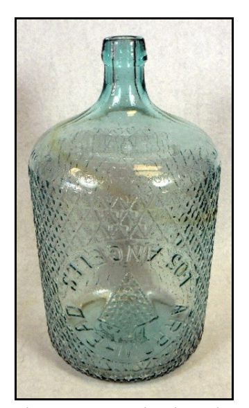
Figure 2 – Arrowhead 5-gal

Several eBay sellers have offered five-gallon water bottles made for Arrowhead or Puritas with an ornate shield on the base surrounding a lone "L" and a two-digit number.