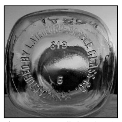
Figure 21 – Bernardin base

Toulouse (1969:46) listed a jar embossed "Bernardin (upwardly slanted cursive with underlining tail) / MASON" on the body and "W.J. LATCHFORD CO., LOS ANGELES" in a circle on the base (Figure 20). He dated the jar "between 1932 and 1938." He noted that a variation was embossed "EXCELLENT FOR JELLIES" on the reverse. He also listed a variation