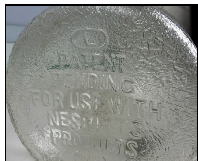
Figure 9 – Krinkled base (eBay)

an amber beer bottle base embossed with an L-in-an-oval mark above a "0" – possibly a date code for 1940. These challenge the Toulouse assertion that the Oval-L mark was used since