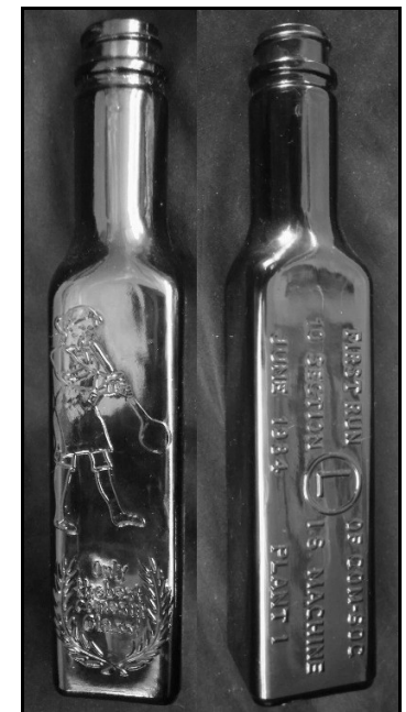
Figure 23 – Commemorative bottle (eBay)

By 1982, Latchford still operated all three plants, making "one-way and returnable beer & beverage; food, household chemicals; liquor; preserve jars; [and] private mold" containers ( Glass Industry 1982:40). In 1984, the plant installed Individual Section (IS) machines, beginning production in June with a commemorative bottle. One face was embossed with a line drawing of the glass blower above "Only / the best / comes in / Glass" in a laurel wreath. The opposite face was embossed "FIRST RUN OF COM-SOC / 10 SECTION I.S. MACHINE / JUNE 1984 PLANT 1" with a large Circle-L in the center (Figure 23). The base was embossed "Circle-L / L-10513 / 84 28."