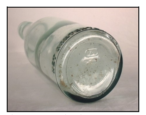
Figure 6 – Squared oval L

We discovered a machine-made beer bottle in California with L in a round-cornered, horizontal rectangle embossed on its base. The base was not stippled and had no number codes (Figure