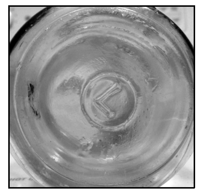
Figure 5 - L in ejection scar (eBay)

It is very important not to confuse the Circle-L basemark on milk bottles – apparently only used by Latchford in 1932 – with an "L" in an ejection scar used on milk bottle bases by the Liberty Glass Co. during the 1920s (Figure 5). The ejection scars are almost always off center, and they should appear on bottles with "L.G." or "L-G" embossed on the heels