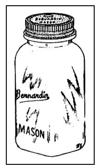
Figure 22 – Bernardin jar (Creswick 1987a:29)

By his second book, Toulouse (1971:47) only mentioned the Latchford-Marble Glass Co. as the maker of the jar. Creswick (1987:29) illustrated the jar (only as being made by the second company) and noted that the metal insert was marked "Bernardin Mason / The Ideal Vacuum Seal" with a Good Houskeeping seal (Figure 22). Like Creswick, Roller (1983) failed to mention the early variation, although he noted the one from Latchford-Marble (see below). He dated the jar 1938-1957, the entire tenure of the company. Roller (1983:66) noted the jar as being made ca. 1940s-1950s. The Roller update (2011:103) stated that the firm made various lid inserts for the jar and dated it from early 1946 to the 1950s.