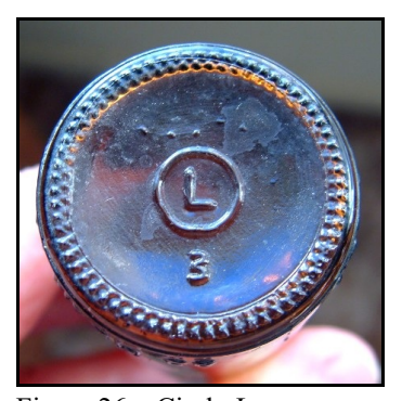
Figure 26 - Circle-L

discovered a single example of the logo embossed on the heel of a beer bottle rather than the base (Figure 27). Since we have identified bottles with Circle-L year codes as early as 1957 and as late as 1989, this