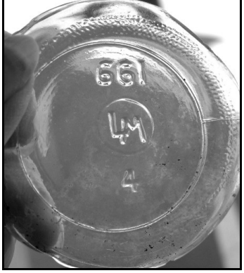
Figure 19 – Circle-LM base

/ 3 mark, both from the same assemblage. The collection in general dated ca. 1940-1950. Conceivably, 0 could equal 1940 and 3 could be 1943. Single-digit date codes were common during the 1930s. A final example was embossed "661 / Circle LM / 4" (Figure 19). A 39 / Circle-LM was likely 1939 (on a wine bottle base), but it seems odd for the glass house to have used both single- and double-digit date codes. However, we have seen that before – with the 3-5-