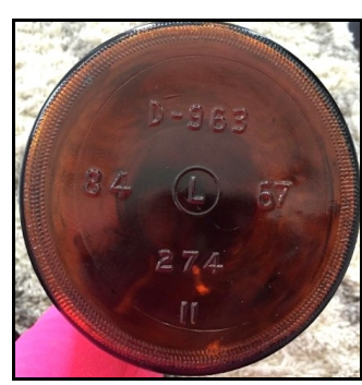
Figure 28 – Liquor code (eBay)

Latchford-Marble received "84" as its federal liquor code by at least 1952, probably earlier – possibly in place for the W.J. Latchford Co., when Federal law required a specific code sequence beginning in 1934. Examples from eBay sellers included "D-963 / 84 Circle-L 67 / 274 / 11" and "LIQUOR BOTTLE / 6 Circle-L 345-D5 / 84 73"(Figure 28) Although the requirement for the code ceased in 1964, Latchford apparently continued to use the codes until at least 1978. An amber half-pint Seagram's 7 whiskey flask was embossed on the base with "L-90712 Circle-L / 86 24" (Figure 29).