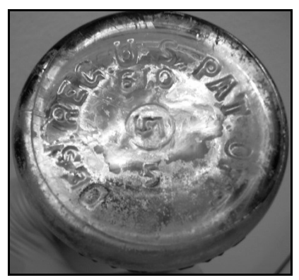
Figure 18 – Unstippled base (Tucson Urban Renewal Project)

None of the marks were listed in Peterson (1968) or Giarde (1980). As discussed above, this mark, too, remained on a 1964 table of glass trademarks complied by Owens-Illinois in 1964 (Berge 1980:83). Some bases with these logos were stippled (e.g., see Figure 17); others were not (Figure 18).