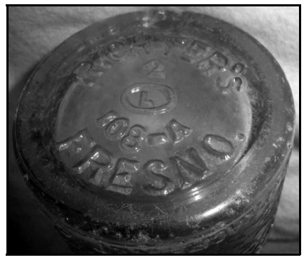
Figure 7 – Oval L

We discovered a machine-made beer bottle in California with L in a round-cornered, horizontal rectangle embossed on its base. The base was not stippled and had no number codes (Figure