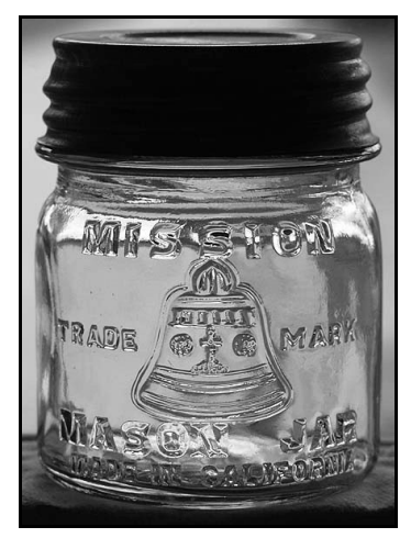
Figure 10 – Mission Mason (eBay)

Toulouse (1969:218-219; 1971:634) noted that a "MISSION MASON JAR" in conjunction with an embossed bell was found on jars made by the W.J. Latchford Co. between 1925 and 1938. The front was embossed "MISSION / TRADE {bell figure} MARK / MASON JAR / MADE IN CALIFORNIA (Figure 10). Creswick (1987:96) illustrated the jar showing