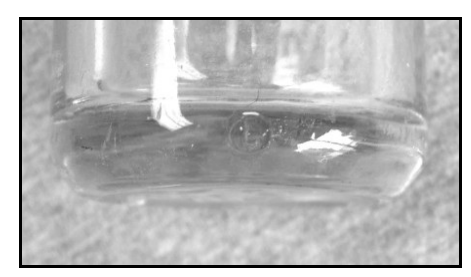
Figure 27 – Circle-L heel

discovered a single example of the logo embossed on the heel of a beer bottle rather than the base (Figure 27). Since we have identified bottles with Circle-L year codes as early as 1957 and as late as 1989, this