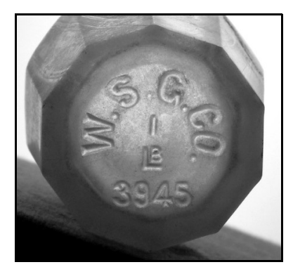
Figure 2 – LB hand

The early history of Long Beach Glass is somewhat confused. Hopefully, future research will determine which version (if either) is correct. The later history is more clear and complete. Toulouse seems to have been correct both about the logo used by the firm and duration of the use.