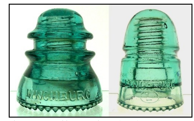
Figure 3 – Lynchburg Insulators (eBay)

There is no question at all that the Lynchburg Glass Corp. made insulators marked with the Oval-L logo, "LYNCHBURG," or both (Figure 3).