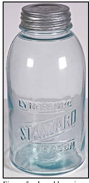
Figure 5 – Lynchburg jar

The Lynchburg Glass Corp. made the LYNCHBURG STANDARD MASON jar as a sideline during the 1923 to 1925 period (Figures 4 & 5). The company's main product by that time was insulators. The jars were machine made, and – as may be expected from the short production period – uncommon (Creswick 1987:84; Roller 1983:200; 2011:304; Toulouse 1969:292; 1971:337). Woodward (1988:21-22) noted that insulators were marked LYNCHBURG and that nothing else was made "except for a few fruit jars, produced for a couple weeks" during the