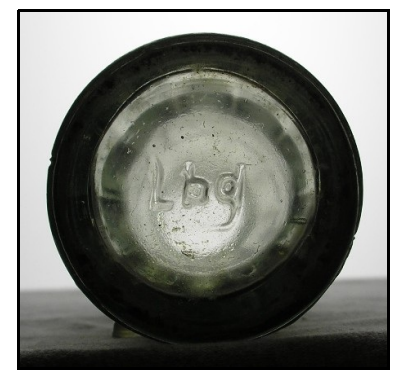
Figure 1 – Lbg (Bill Porter)

3/26/2008) confirmed that the "b" and "g" in the mark were lower case and that the logo was embossed on the heels of Coke bottles with either a "19" or "20" to the right of it. The