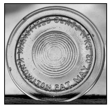
Figure 9 – Mansfield lid (North American Glass)

on the base (Figures 7 & 8). The glass lid was embossed "MANSFIELD GLASS W'KS (arch) / KNOLTON PAT. MAY .03 (inverted arch)" (Figure 9). The screw caps were stamped "MANSFIELD VACUUM" in arched, double-outline