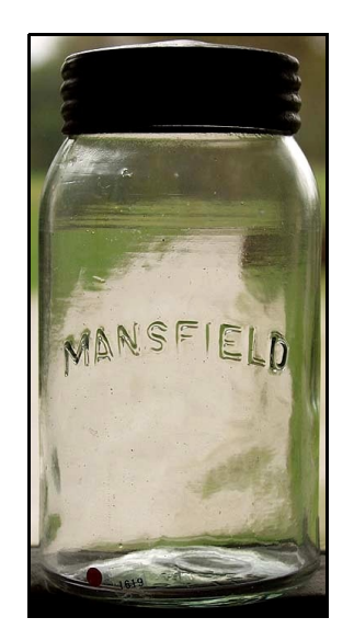
Figure 7 – Mansfield jar (North American Glass)

Roller (1983:185; 2011:284) added that the lids on these jars were embossed "KNOWLTON VACUUM PAT'D MAY 1903," and the metal caps were stamped the same as the Mansfield jars (see below) but had six holes in the top. He dated the jars ca. 1903-1908, made by the Mansfield Glass Works and ca. 1909 by the Hazel-Atlas Glass Co. Creswick (1987b:79) illustrated the jar,