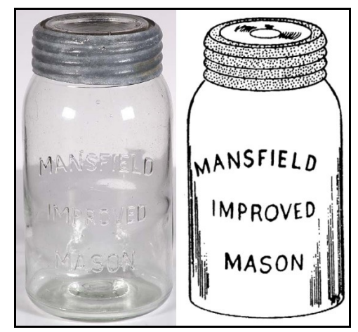
Figure 3 – Mansfield Improved Mason (Creswick 1987b:86; North American Glass)

Toulouse (1969:194) described a machine-made jar embossed "MANSFIELD (slight arch) / IMPROVED / MASON (both horizontal)" and dated it ca. 1900-1910 (Figure 3). He suggested the Reid Bottle Co. at Mansfield, Ohio, or the Mansfield Glass Works at Lockport, New York, as possible manufacturers, noting that "the latter, however, is not known to have used machines." Toulouse was incorrect about the lack of machines, of course (see above).