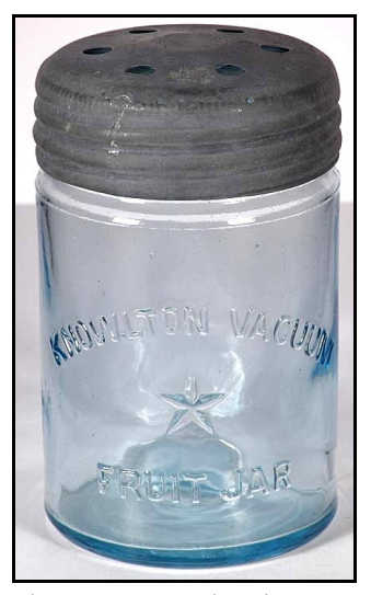
Figure 4 – Knowlton jar

spring, held by perforated metal cap" (Figures 4 & 5). He noted that the jars were made to the Dallas Knowlton 1903 patent but did not guess the manufacturer (see the