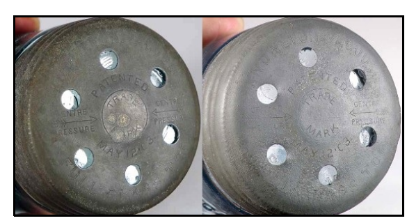
Figure 5 – Knowlton cap (North American Glass)

spring, held by perforated metal cap" (Figures 4 & 5). He noted that the jars were made to the Dallas Knowlton 1903 patent but did not guess the manufacturer (see the