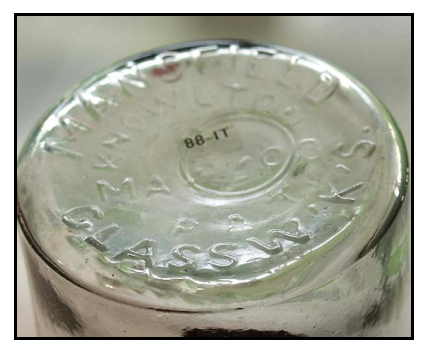
Figure 8 – Mansfield base

on the base (Figures 7 & 8). The glass lid was embossed "MANSFIELD GLASS W'KS (arch) / KNOLTON PAT. MAY .03 (inverted arch)" (Figure 9). The screw caps were stamped "MANSFIELD VACUUM" in arched, double-outline