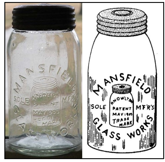
Figure 11 – Mansfield Knowlton jar (Creswick 1987b:85; North American Glass)

Mansfield also made a jar embossed "MANSFIELD (arch) / SOLE {jar drawing} MF'R'S (horizontal) / GLASS WORKS (inverted arch). The jar drawn in the center of the body was a screw-top jar embossed "KNOWLTON (slight arch) / PATENT / MAY 1903 (all horizontal) / TRADE / MARK (upwardly slanted)" (Figure 11). This, too, Roller (1983:205; 2011:310) dated ca. 1904 to 1908. Creswick (1987b:85), however, dated the jar ca. 1903 and noted that "only 1 jar is presently known." This was probably made as a salesman's sample or an initial run.