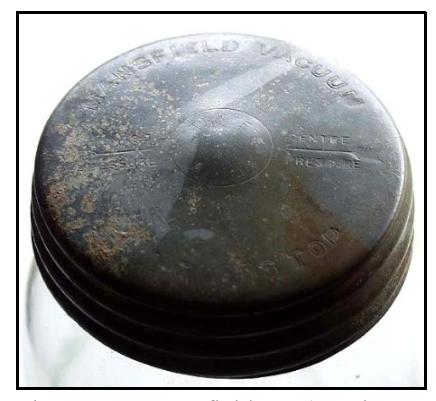
Figure 10 – Mansfield cap (North American Glass)

Mansfield Glass Works, Lockport, New York, from ca. 1904 to 1908 (Roller 1983:204; 2011:310).