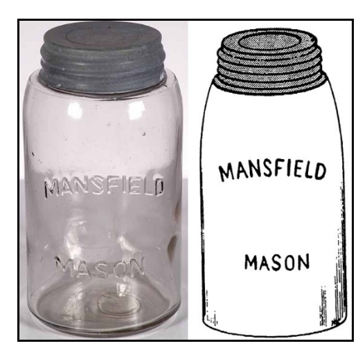
Figure 2 – Mansfield Mason (Creswick 1987b:86; North American Glass)

Roller (1983:205; 2011:310) illustrated and described the "MANSFIELD (slight arch) MASON (horizontal)," a typical machine-made, shoulder-seal Mason jar (Figure 2). He dated these ca. 1903-1908. Creswick (1987b:86) illustrated the jar and dated it ca. 1904; Toulouse (1969:194) placed the dates at ca. 1900-1910. Spear & Spear (1970:38-39) discovered a Mansfield 1904 pamphlet that discussed all four types of fruit jars produced at the factory. It called the Mansfield Mason "a good old standby" and noted that all such jars were hand made prior to 1902, machine made since that time. This suggests that mouth-blown jars were made