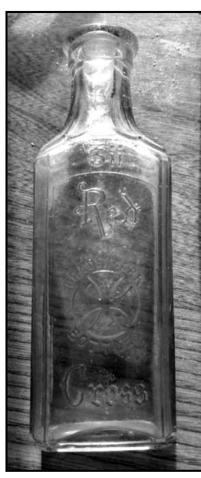
Figure 5 – Red Cross 1

Several eBay auctions showed that there were variations in the bottles. On some, the side as well as the base was marked with "Red Cross," although only the body marking used the full trade mark (Figure 5). Another variation had the trade mark embossed on the side just below the shoulder but not the base (Figure 6). A final variation was only marked on the base (Figure 7). All variations appear to be graduated on both sides of the center plate and were made with reinforced prescription finishes.