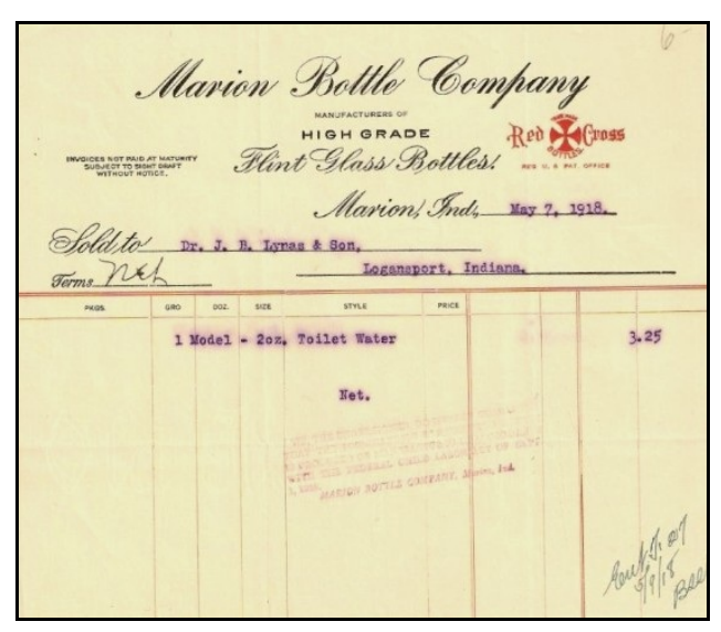
Figure 4 – Marion Flint invoice (eBay)

Bethman (1991:76) noted that "the name of 'Red Cross' was a trademark for a certain line of prescription bottles produced by the Marion Flint Glass Company." Bethman (1999:444) illustrated a single example of the RED CROSS bottle and dated it ca. 1914. Coincidentally, Marion Flint began offering sterilized bottles that were hand packed in dust-proof boxes, apparently the only glass house to do so at that time (Southern Pharmaceutical Journal 1914:42). According to Griffenhagen and Bogard (1999:45), Marion registered "the symbol of