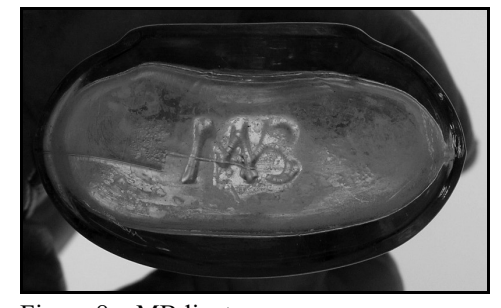
Figure 8 – MB ligature

We have seen a single style of colorless, mouthblown drug store bottle embossed with "MB" on the base (Figures 8 & 9). The right "leg" of the "M" extended slightly into the left edge of the "B" – creating a ligature. The bottle was also embossed on the flat front panel with graduation scales in ounces and cubic centimeters. At least one example was machine made (Figure 10). In addition, we have a round, amber medicine bottle – also