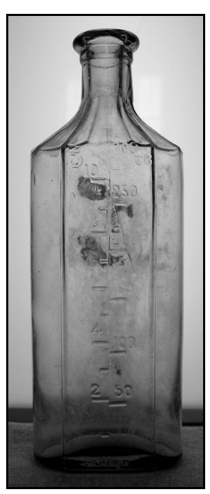
Figure 9 – MB bottle (Ft. Bliss)

machine made – with the MB ligature on the base (Figures 11 & 12). There is no consistency in the font used for the ligature. The "M" was made with both serif and sans serif fonts, and the rounded sections of the "B" can be almost any shape. The two letters are also connected in a variety of ways, sometimes with very sloppy overlapping of the letters (see figures 8, 10, & 11).