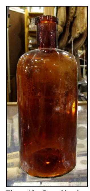
Figure 12 – Round bottle

at some point. When the Upland Flint Glass Co. purchased the firm, it converted everything to fully automatic machines. Therefore, it is probable that the machine characteristics do not question the identity of the logo.