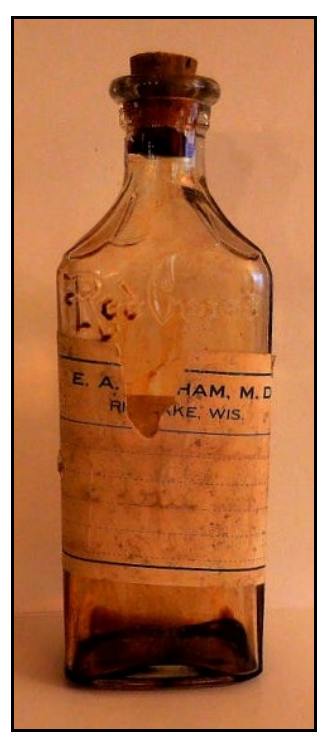
Figure 6 – Red Cross 2

1908, claiming a use since November 1, 1894." Peterson (1968:42) confirmed mark and the date. A 1921 Marion Bottle Co. billhead clearly shows that the bottles were used until the end of the company (Figure 4).