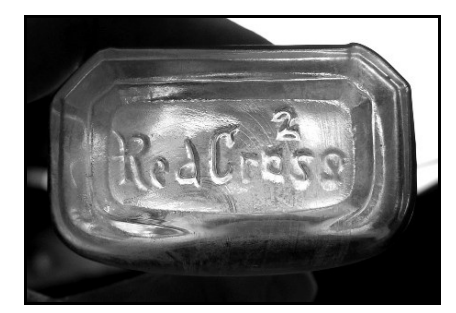
Figure 7 – Red Cross 3

Marion Flint Glass Co. and the Marion Bottle Co., the term was probably only embossed on bottles between ca. 1900 and 1922. There was probably a temporal order to the variations, likely the more complex design first, followed by the shoulder label, with the basemark used most recently. If this ordinal scale is correct, the earliest was almost certain made during the Marion Flint Glass Co. period (1900-1916), while the last one was produced during the Marion Bottle Co. era (1916-