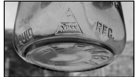
Figure 5-5 – 7 MINN

The Liberty Glass Co. received the number “7” from Minnesota, and the number in the triangles is almost as common as the one from Thatcher. Although there were some shoulder triangles, most of these, were heelmarks (Figure 5-5).