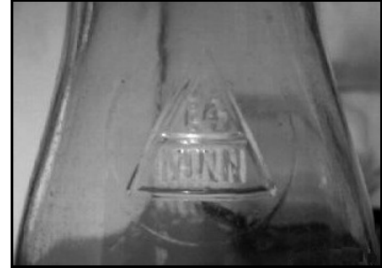
Figure 5-4 – E4 MINN

E4 was the logo of the Essex Glass Co., and Minnesota allowed Essex to use the full mark on the Seal (Figure 5-4). So far, we have only seen the mark in round shoulder plates.