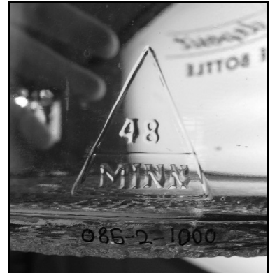
Figure 5-9 – 48 MINN

The Berney-Bond Glass Co. managed to capture number 48 in every state where it applied – including Minnesota (Figure 5-9). The logo was embossed on both shoulders and heels of milk bottles, although it could only have been used from 1913 to 1930, when the Owens-Illinois Glass Co. purchased the firm.