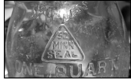
Figure 5-10 – 52 MINN

probably the second configuration (Figure 5-10). Both of these were probably only embossed on shoulders. Lamb also used a “52 MINN” seal at some point, probably only on the heel.