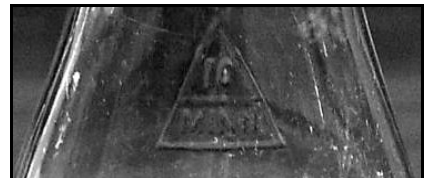
Figure 5-6 – 10 MINN (eBay)

The Universal Glass Products Corp. typically used the number 51 – even with its heelmark UGP51. However, both the Dairy Antiques (2016) and an eBay auction tied the 10 MINN triangle to Universal Products.(Figure 5-6).