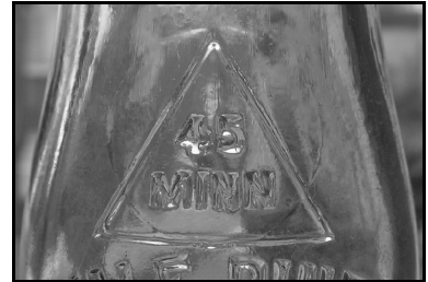
Figure 5-8 – 45 MINN

The F.E. Reed Glass Co. received the number 45 and embossed it on the shoulder of its bottles (Figure 5-8). The firm was in business using that name (other ones earlier and later) from 1909 to 1947, making milk bottles during that entire period, so the logo should also appear on heels – although we have not seen one.