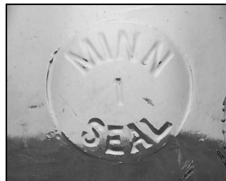
Figure 5-1 – Circular MINN 1 SEAL

The typical early format was an embossed triangle with the glass house number above “MINN” with a horizontal line in between. An ad placed by the Essex Glass Co. in 1916 illustrated the E4-triangle mark ( Milk Dealer 1916:58). The earliest example we have found was a Thatcher Mfg. Co. bottle made in 1918 with the triangle in a circular plate at the shoulder, but an atypical Thatcher container had a 1922 date code and “MINN (arch) / 1 / SEAL (inverted arch)” in a small, circular pate on the shoulder (Figure 5-1).