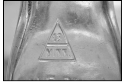
Figure 5-7 – 40 MINN

Another mystery number was 40. It appeared on a shoulder triangle in an eBay auction and is distinctly a 40, not a 10 or other number (Figure 5-7). We have not found that number recorded anywhere.