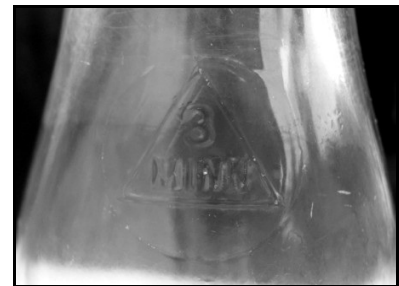
Figure 5-3 – 3 MINN (eBay)

The “3 / MINN” symbol is very unusual. According to Dairy Antiques (2016), it was assigned to the Atlantic Bottle Co. In all other states, Atlantic (and its predecessor Fidelity Glass Co.), used the number “2.” The only example we have found (on eBay) apparently lacked the “ABC2” heelmark found on all Atlantic bottles we have previously encountered. This bottle only had “50” on the heel and “28” in the ejection scar on the base (Figure 5-3). The “3” from Dairy Antiques may have been a typographic error for “2,” but that leaves us with the question: Who used the “3” code?