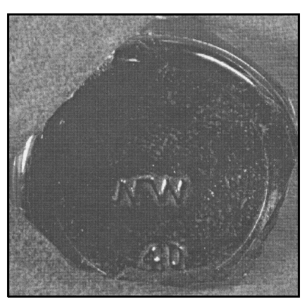
Figure 5 – NW 40 (Spathe 2000:153)

The earliest beer bottle base we have so far was reported and photographed by Späth et al. (2000:95, 153). This nonstippled base had the NW-Ligature mark embossed slightly below the center with "40" below it almost on the basal indent line. The typical three-digit catalog codes (see below) were absent (Figure 4).