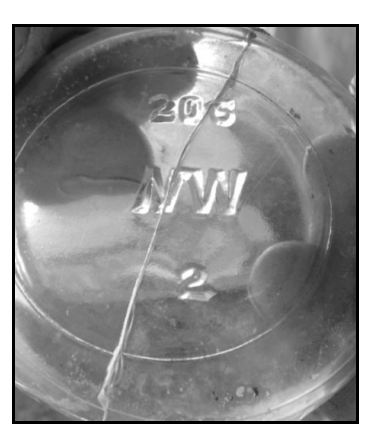
Figure 4 – NW base

The earliest beer bottle base we have so far was reported and photographed by Späth et al. (2000:95, 153). This nonstippled base had the NW-Ligature mark embossed slightly below the center with "40" below it almost on the basal indent line. The typical three-digit catalog codes (see below) were absent (Figure 4).