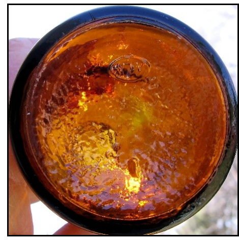
Figure 9 – Oval logo

A 1964 glass trademarks table compiled by Owens-Illinois showed the "N" in the NW-Ligature in italics and in an elliptical oval with the lower left end of the "N" and the upper right end of the "W" touching the oval (Berge 1980:83). We have found this mark on an amber, export, returnable beer bottles with an embossed ring round the shoulder/neck joint and on an amber base fragment,