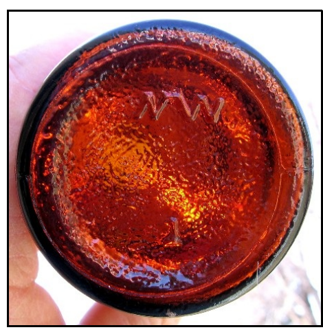
Figure 8 - Italics N

We have found a single example of this mark on an amber, export, returnable beer bottle with an embossed ring aound the shoulder/neck joint (Figure 8). The base was heavily stippled, with the logo in the upper section and a "1" in the lower section. Both were offset slightly to the right of center. A colorless round base (bottle type unknown) was embossed "206 / NW (with the "N" in italics) / 2." The stippling on the amber base is an