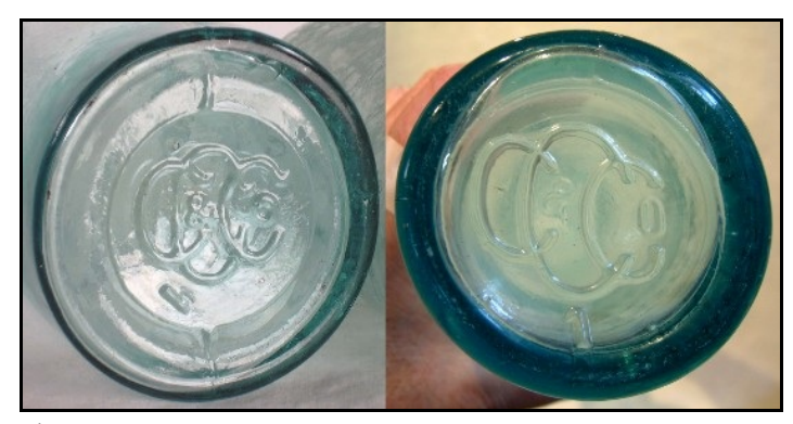
Figure 2 – CC&Co monogram

were on aqua glass, where the OGCo monograms were usually on amber bases.1