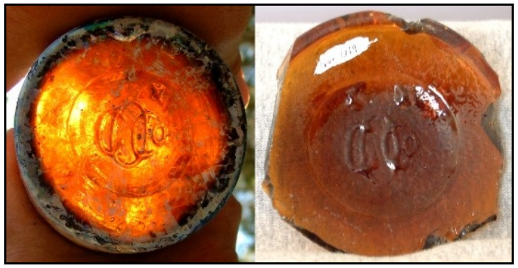
Figure 1 – OGCo monogram (Hillsboro, NM & San Elizario)

The OGCo monogram is superficially very similar to the much more common CC&Co monogram used by Carl Conrad & Co., used from 1876 to 1882. Both are composed of very thin-lined letters, with a large central character, flanked on both sides by smaller letters. Unlike the CC&Co mark, however, the OGCo monogram had a "tail" on the lower part of the initial "C" to form a "G"; the ends of the central "C" had been joined to form an "O"; and the ampersand (&) was missing (Figures 1 & 2). Even though the OGCo monogram has been frequently mistaken for the CC&Co monogram (e.g., Baxter 1998:4), they are clearly two distinct marks. Another difference is that all reported Carl Conrad marks (and all we have been able to find on eBay and other sources)