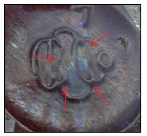
Figure 5 – Altered closeup (TUR)

show the line that connects the two ends of "C" or form the "O" slightly out of kilter with the rest of the letter. The line that forms the "G" also appears to be an afterthought (Figures 4 & 5).