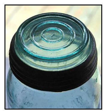
Figure 3 – Glass lid (North American Glass)

The jars were actually embossed "PAT<sup>D</sup> FEBY 9<sup>TH</sup> 1864 (arch) / VICTORY / 1 (both horizontal) / REISD JUNE 22D 1867 (inverted arch)" on one side and "PACIFIC (arch) / SAN FRANCISCO (horizontal) / GLASS WORK (inverted arch)" on the other. Roller (1983:374) noted that the glass lid was embossed with three concentric circles around a number (Figure 3) and that the Harris reissue was dated January 22, 1864, rather than June – as embossed on the jars.