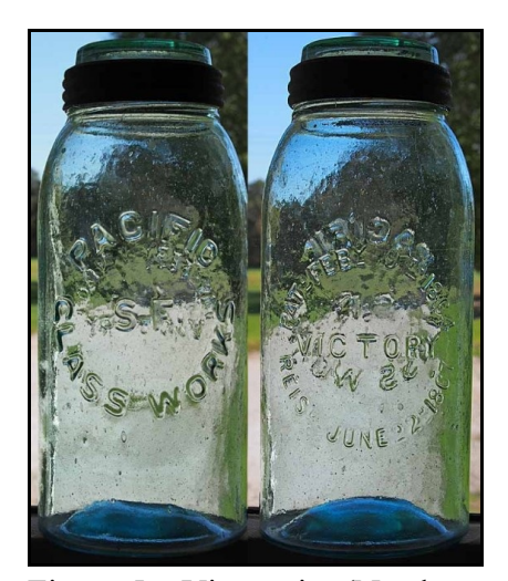
Figure 5 – Victory jar (North American Glass)

GLASS WORK" and "PACIFIC / S.F. / GLASS WORKS" (Figures 4 & 5). He suggested ca. 1860s-1870s as a production range and commented that the "1" below "VICTORY" was sometimes absent.