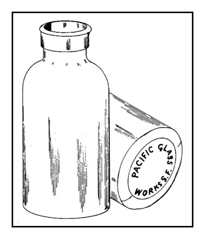
Figure 2 – Pacific Glass Works (Creswick 1987:167)

Roller (1983:273) discussed a jar embossed "PACIFIC GLASS WORKS S.F." on the base and noted that the closure was uncertain "but may have been a waxed cork." He added, "Only one of these jars has been reported, and it was without closure. The jar has a slight stopper well, and a glass bead around the lip"; he dated it 1863-1876. Creswick (1987:167) illustrated the jar and dated it ca. 1862-1876 (Figure 2). The Roller editors (2011:403) included measurements – 9 inches tall, 2.25 inches in diameter at the mouth, and 4.5 inches in diameter at the base. Laybourne (2014:366) valued the jar as "Unpriced" and agreed that only one example (broken) exists. We have suggested a probable date of ca. 1869 because this jar was probably a precursor to the Victory jar discussed below.