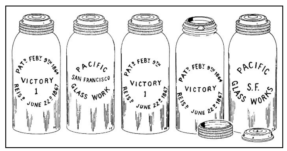
Figure 6 – Victory jars (Creswick 1987:214-215)

"SAN FRANCISCO" and "S.F." as well as a variation of the "SAN FRANCISCO" reverse with "1864" missing. The Roller update (2011:539) added two California variations – "PACIFIC GLASS WORK around SAN FRANCISCO" and "PACIFIC S.F. GLASS WORKS BUTTER JAR." Leybourne (2014:454), however, did not include "BUTTER JAR" in the embossing and noted" Butter jar; Different shape, same lid size."