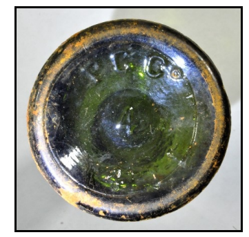
Figure 4 – PGC<sup>o</sup> (Ellen Gerth)

All of these were on champagne beer bottles with crown finishes, each in a typical "British green" color (Figure 2). An eBay auction added an amber flask with a paper label for White Horse Blended Scotch Whiskey that was embossed "PGC / 3•" on the base (Figure 3). A 1951 directory noted the "Trade Name" for Portland Glass as "P.G.C." (Grace's Guide 2017).