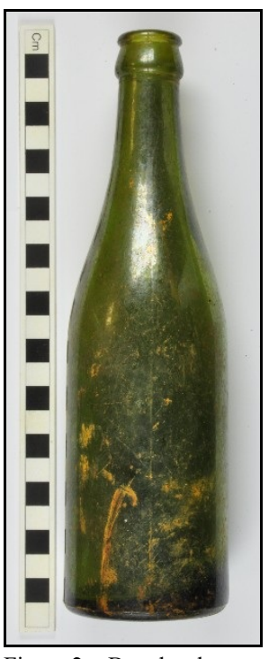
Figure 2 – Beer bottle (Ellen Gerth)

Glasgow Scotland" with "P.G.C. 45" embossed on the base. This suggests that Toulouse was correct about the use of the mark by Portland, and the "45" may have been a date code.