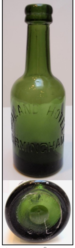
Figure 5 – PGC<sup>O</sup>

Current research leaves several issues connected to the Portland Glass Co. unclear, incomplete, and/or confused. The most glaring example was the contention by Toulouse (1971:421) that Portland Glass was founded by General G.W. Walker at Greenford, Middlesex, England. Although references to Walker's military career were easy to locate online, we could find no connection with Portland Glass at Greenford. Toulouse further claimed that "Sir Harry McGowan . . . took it [i.e., Portland Glass] over, in 1932. The factory was then operated by International Chemicals, Inc." Sir Harry McGowan was actually the Chairman of Imperial Chemical Industries, but we found no connection with McGowan and Portland Glass or Greenford. All of the