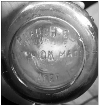
Figure 7 – Po'keepsie