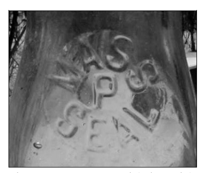
Figure 8 – Mass P Seal (Al Morin)

In 1909, the state of Massachusetts awarded the Poughkeepsie Glass Co. the use of "P" in their milk bottle seal program (von Mechow 2018). Massachusetts instituted the first "seal" program in the U.S. in 1900, requiring that milk bottles be certified to contain the correct measure (e.g., one full pint). Initially, each dairy had to bring in its bottles to the sealer, but, in 1909 the law shifted the onus from the dairies to the