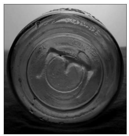
Figure 9 – P-3

The Hansee's Palace Home Jar was almost certainly