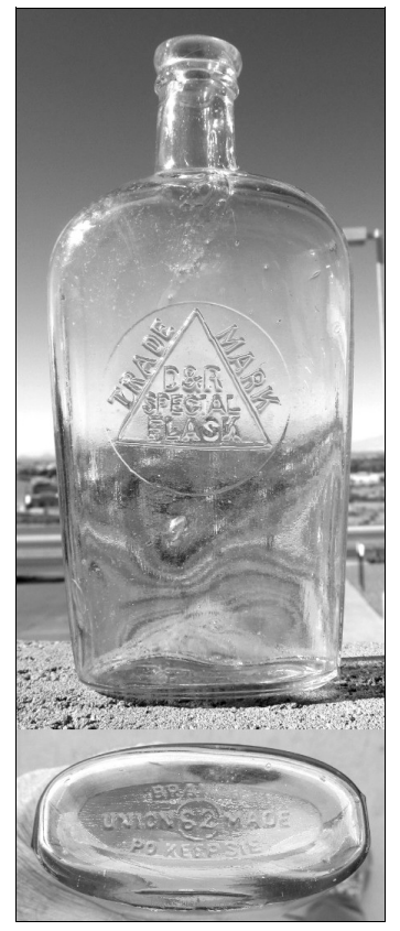
Figure 5 – Po'keepsie

Von Mechow (2018) included ten examples of champagne beer bottles embossed on their bases with "BRANCH 62 (arch) / UNION {letter in circle} MADE (horizontal) / PO'KEEPSIE (inverted arch)" (Figure 6). The letters could extend between at least A and G as well as one with OK in the circle. Unfortunately, we could only find dating information for two of these firms. One, Burke & Hastings of Clinton, Massachusetts, was a soda bottler, in business from at least 1906 to 1908. Robichaud & Gauthier of Gardiner, Massachusetts, was a liquor dealer that opened in 1900 and remained in business until at least 1904 (Figure 7). This suggests a date range for this bottle style in the early 1900s.