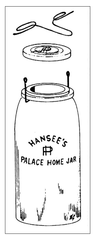
Figure 4 – Palace Home Jar (Creswick 1987a:80)