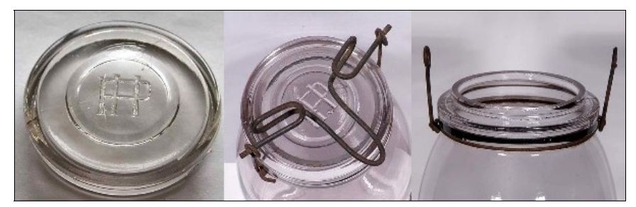
Figure 2 - Palace Home Base (North American Glass)

Roller (1983:148; 2011:230) was more informative. Roller noted: