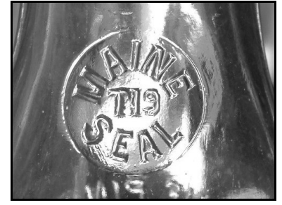
Figure 9 – Maine T19 seal

The only example we have seen was embossed "MAINE / T19 / SEAL" in a circular format (plate) with "T" in an inverted triangle in the center of the base and "T-19-15" in an inverted arch at the bottom of the base (Figure 9). The "15" is a date code for 1915 and shows that the circular format was in place by at least that date. It is likely that Travis made bottles for Maine dairies until it ceased production at the end of 1919, although the apparent scarcity of bottles with the T19 seal