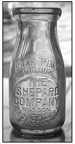
Figure 6 – Mass. seal

Another "TR" seal was added to a "STORE / BOTTLE" plate. These were used on bottles that were sold in stores during the period when home delivery of milk was the norm. On this seal, the logo "MASS SEAL / TR" was embossed at the bottom of the plate below the word "BOTTLE." A third had "MASS SEAL / TR" added below "THE SHEPARD / COMPANY" in a round front plate (Figure 6). It is possible that other variations added to the plates will be discovered.