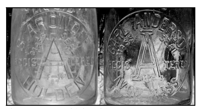
Figure 5 – Mass. seal (Al Morin)

The TR seal is found in at least four locations on milk bottles and in four configurations as summarized in Table 1. Probably the earliest configurations are two that were added to existing plates. One of these had the "seal" built around a large letter "A" (probably meaning "Grade A") in the center of the plate. "MASS" was embossed along the left upper slope of the