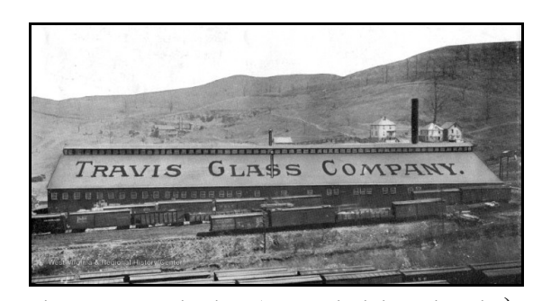
Figure 2 – Travis plant (West Virginia University)

November 17 that the plant had "installed another of their own machines, which is a three-man machine run by electricity. This is the second machine they have in operation, one on quart milks and the other on pints, and both are said to be giving satisfactory results." By March 17 the following year, the Weston unit was using "three O'Neill machines . . . making quart milks" at a single tank. The combined plants now operated a