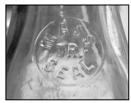
Figure 8 – Mass. seal

A slight variation had the circular "MASS. / TR. / SEAL" (with periods after MASS and TR) on the reverse shoulder and the words "MASS SEAL" added to the front body plate (Figure 8). However, the plate had no reference to "TR" or Travis, only the local dairy. The base had the Travis T-in-an-inverted-triangle mark with no discernable date code. See Lockhart et al. (2017) for more information about Massachusetts seals.