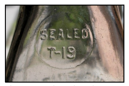
Figure 10 - Wisconsin seal

Rhode Island extended the T.19 Seal to Travis by at least 1916, and the seal was formed in a circular format. Michigan granted Travis the T-19 Seal during the same year, and Wisconsin also issued the 19 Seal to Travis in 1916 (Figure 10). We have not discovered a Travis seal in any additional states. See Lockhart et al. (2017) for more information.