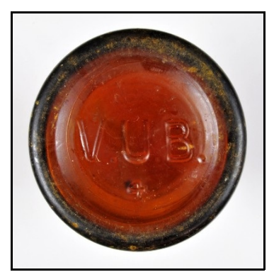
Figure 9 – VUB (Josiah Russell)

The "VUB" basemark was found on the base of an amber machine-made beer bottle (Figure 9). Although the possibility cannot be entirely eliminated, the initials probably did not represent a glass house. The "B" likely indicated the word "Brewery" – and the other initials finished out the name of the business.