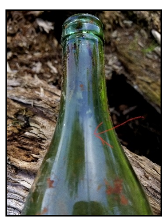
Figure 4 – Seam end (Amy Recter)

Because of the crudeness, the bottle was likely produced by some form of early semiautomatic machine. The base photo showed what may have been a machine scar, but the horizontal