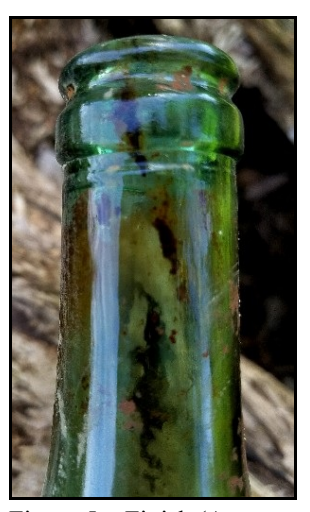
Figure 5 – Finish (Amy Recter)

Amy Rector sent us photos of a machine-made bottle with an unusual two-part finish and "VE" embossed on the base (Figures 4, 5, & 6). The green color may be more suggestive of a European manufacture. The top ring on the finish could have been used for a crown cap, although the lower ring was very atypical for that closure. It could even have used a closure similar to the Kork-and-Seal that was primarily used for liquor bottles. This one probably contained some kind of soda or mineral water.