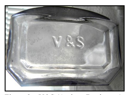
Figure 8 – V&S (Antique Bottles.net)

Our three examples of the "V&S" basemark (from Antique Bottles.net) were on colorless, mouth-blown bottles. One had a double-stamp, a feature absent from the other two (Figure 8). Although other examples of double-stamped bottles we have examined fell between ca. 1895 and ca. 1914 (except some bottles blown by the Adolphus Busch Glass Works – the earliest adopter of the method – ca. 1885), these were obviously made for a few years later. Von Mechow