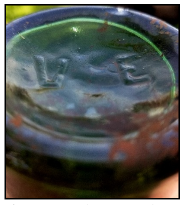
Figure 6 - VE (Amy Recter)