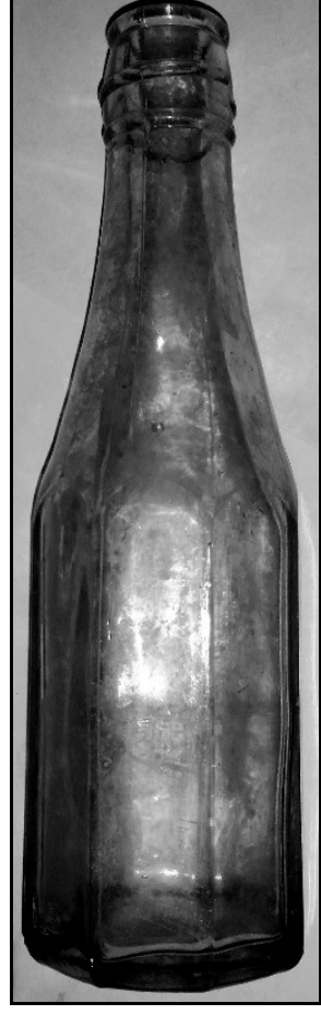
Figure 1 – Catsup

We discovered a machine-made colorless bottle at a bottle show. It was rectangular in cross-section with chamfered corners. The base was embossed "2 {VB-in-an-Oval} L" (Figure 3). Unfortunately, we have lost the photo and description of the finish. The bottle was certainly made during the 20<sup>th</sup> century, after the mid-1920s. The initials could stand for "V. . . Bottle."