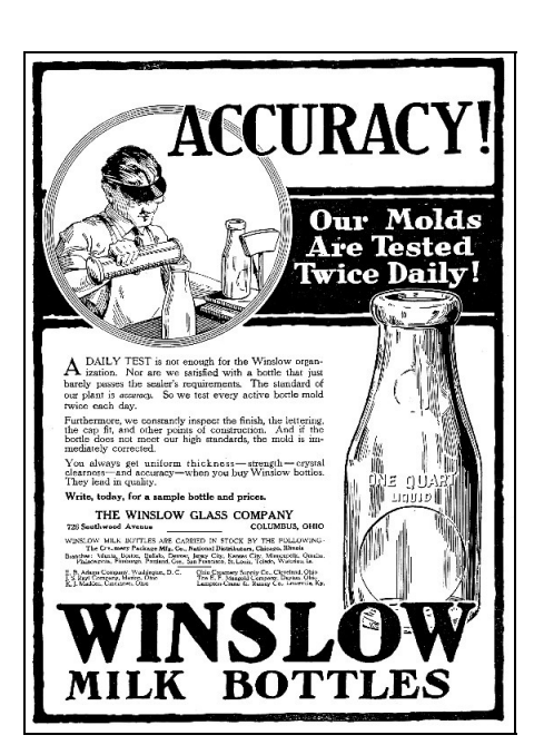
Figure 3 – Winslow ad ( Milk Dealer 1924:93)

Winslow ads during 1924 concentrated on quality control and the strength of the containers. A January ad ( Milk Dealer 1924:51) illustrated a bottle being sawed in half to illustrate the uniformity of the glass (Figure 2). Others noted that there were "no blemishes or rough spots anywhere," and