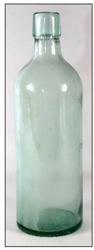
Figure 4 – Peruna bottle

We have seen marks that could be either "M" or "W" on bases of pharmacy bottles. These could have been made by Winslow during this early period, but that identification is shaky at best. Currently, attaching a "W" mark alone to any company should be regarded as a risky identification. An equally (or more) likely choice of manufacturer of the drug store bottles is the Whitney Glass Works (see Whitney section for more discussion).