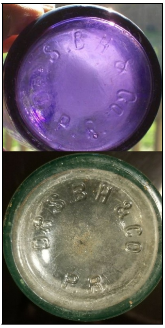
Figure 1 – Peruna bases