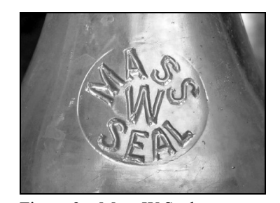
Figure 9 - Mass W Seal

The Massachusetts seals in circular form began to be embossed on the shoulders of milk bottles ca. 1914, so that is a good beginning date for the "W" shoulder seal. These bottles had