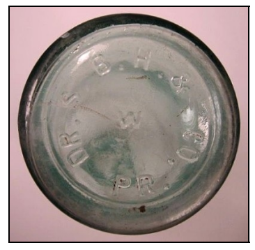
Figure 5 – Peruna base

However, Winslow almost certainly used a solitary "W" in the center of the base to identify the firm as the manufacturer of Peruna bottles (Figures 4 & 5). This virtually certain connection between the "W" mark and Winslow suggests that the plant may have used the logo on other bottle types as well. It is also possible that Winslow made some Peruna bottles with no identifying letter.