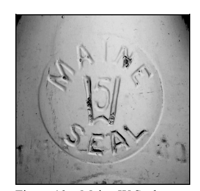
Figure 10 – Maine W Seal

We have observed a single milk bottle with "MAINE (arch) / 5 over W (horizontal) / SEAL (inverted arch)" in a plate mold on the shoulder (Figure 10). The bottle also had the "5 / W" heelmark. Interviews with Maine collectors indicated that this seal was rare. It was probably only used during the very early years of the Maine seals, probably ca. 1915, when the seal was required to be located on the shoulder (Public Laws of Maine 1915:28). The earliest types of seals were on the body and apparently only appeared on bottles made by the Thatcher Mfg. Co.