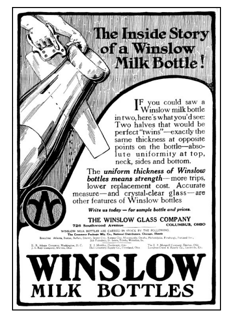
Figure 2 – Winslow ad ( Milk Dealer 1924:51)

one showed a steel hammer being used to test the bottles' strength. One from the January 5 Milk Dealer bragged that the molds were tested twice daily (Figure 3).