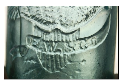
Figure 5 – EW&Co (Jay Hawkins)

Hawkins (2009:535) listed the "E.W.CO. WORKS" mark but