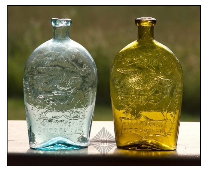
Figure 3 – E Wormser & Co. (Norman C. Heckler)