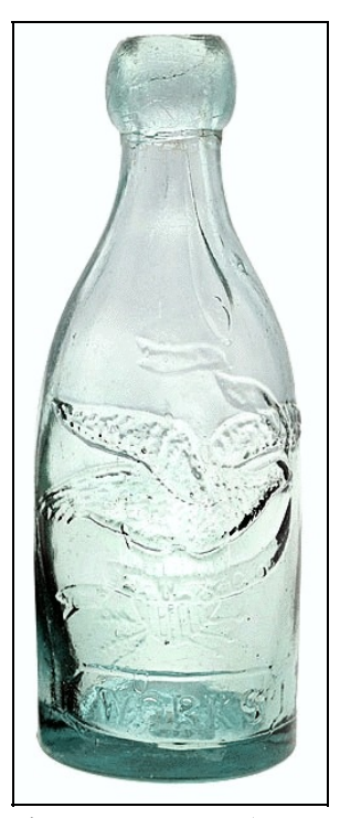
Figure 4 – EW&Co (von Mechow 2020)

did not discuss the type of container or when it was used. Von Mechow (2020), however, noted the mark on a single soda bottle. The front of the bottle was embossed with a flying eagle