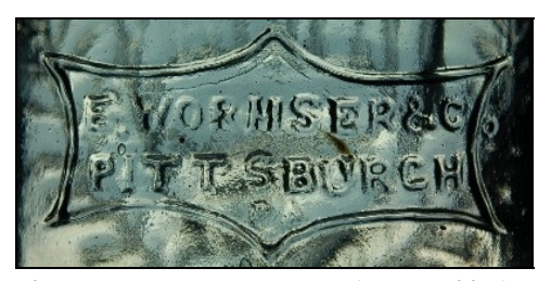
Figure 2 – E Wormser & Co.