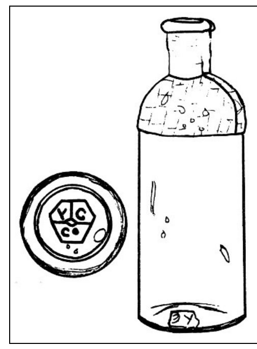
Figure 2 – YGCo (Urquhart 1973:33)

Wills (1974:59) identified the York Glass Co. as the user of the YGCo logo, and British sellers on eBay have confirmed that. We have found no other English