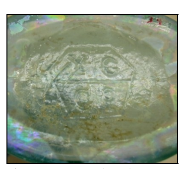
Figure 3 – YGCo (TUR)

or American glass house with the correct initials and accept the Wills identification. Although the bulk of the auctions for the bottles came from British sellers, the bottles have also been found in U.S. contexts. For example, the Bottle Research Group photographed a base with the mark from the Tucson Urban Renewal collection (Figure 3). Bottles we have seen included round, oval, and square cross-sections, including several of the so-called Label Under Glass (LUG) bottles.