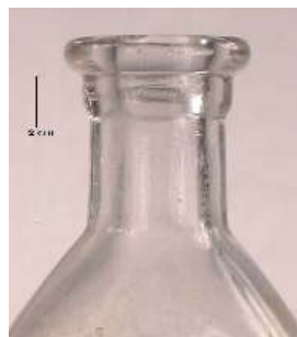
#24 Collared Ring