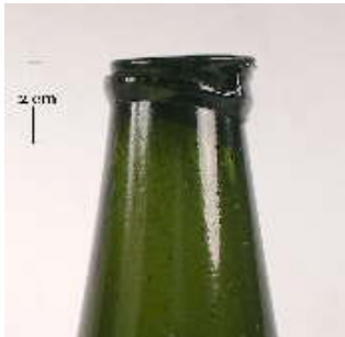
#22 Flared Ring