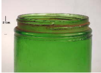
#17 Large Mouth External Threads