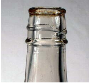
#16 Small Mouth External Threads