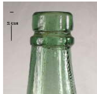
#21 Grooved Ring