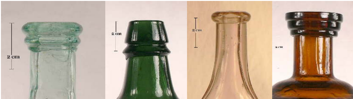
#1 Double Ring