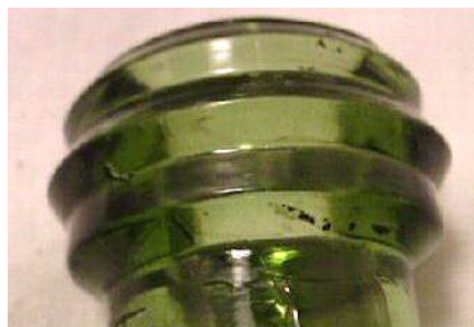
#23 Stacked Ring