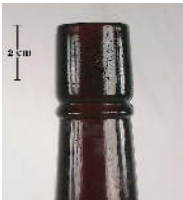
#25 Straight Brandy