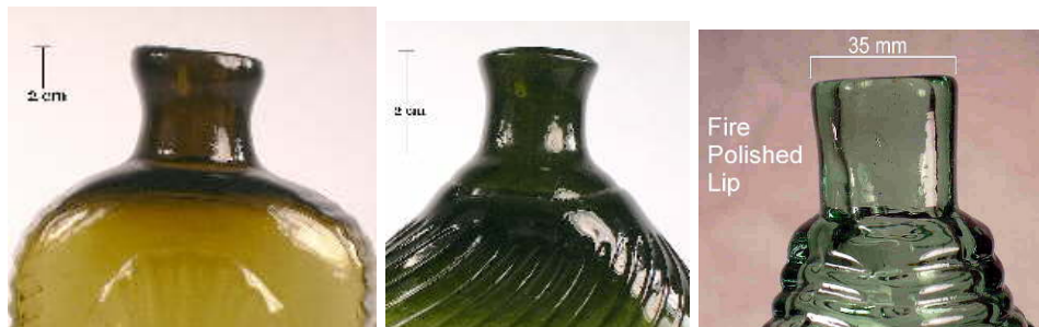
#13 Globular Flare