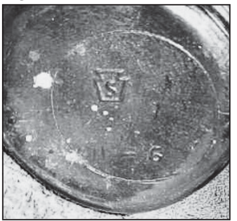
Figure 11: S-in-a-Keystone mark.

The Seaboard Glass Bottle Co., Pittsburgh, Pennsylvania, used the S-in-akeystone mark from the date Knox purchased it from J.T. & A. Hamilton (1943) to the factory's closure in 1947 ( Figure 11 ).