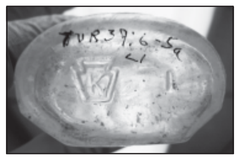
Figure 6: K-in-a-Keystone mark.

Peterson (1968:49) claimed that the Kin-a-keystone mark was first used by Knox Glass in 1932 ( Figure 6 ). Toulouse (1971:293) dated the mark 1924 to 1968 and added that it was later the "general