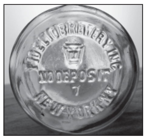
Figure 10: M-in-a-Keystone mark.

The Metro Glass Bottle Co. used the Min-a-keystone mark from its inception in 1935, until Knox sold the plant in 1949 ( Figure 10 ). After 1949, the plant used an "M" in a horizontally elongated hexagon (Toulouse 1971:342).