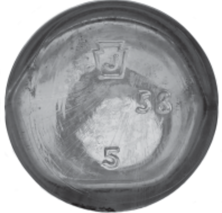
Figure 5: J-in-a-Keystone mark.

( Figure 5 ) from its inception in 1932 (Toulouse 1971:271) until 1952, when Chester Underwood was ousted, and all plants switched to K in a keystone.