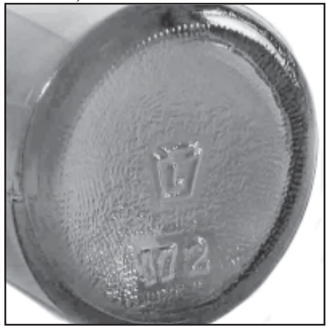
Figure 7: L-in-a-Keystone mark.

The L-in-a-keystone mark was used by the Lincoln Glass Bottle Company, a Knox plant established in Lincoln, Illinois, in 1942 ( Figure 7 ). The company used the mark until the ousting of Chester Underwood in 1952 (Underwood interview).