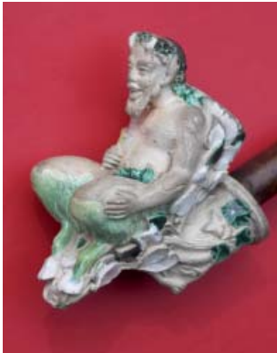
19th Century French pipe depicting Pan

The Society appeals to a wide cross section of people, including professional archaeologists, amateur pipe enthusiasts, family historians, collectors and non-specialists.