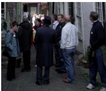
SCPR Members, Whitby 2007

The annual conference usually comprises one day of lectures on local pipemakers and / or recent research and the second day with a field trip to visit local sites of pipemaking or historic interest. There are usually displays of material for viewing and articles / offprints for sale as well as a conference dinner where delegates can socialise and exchange information.